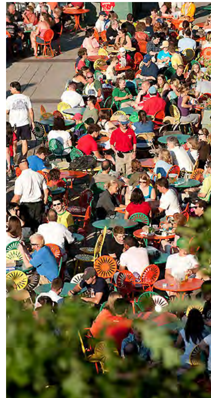
The activity of the Memorial Union Terrace – indoor and outdoor places for people to gather and exchange ideas with a focus on Lake Mendota.