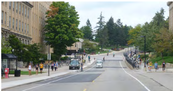
N. Charter Street (Existing) – Looking north toward Linden Drive

Perhaps the most difficult transportation challenge is the N. Charter Street and Linden Drive intersection, which has pedestrian volumes during class changes rivaling Midtown Manhattan intersections. The 2015 Campus Master Plan Update recommends a dramatic grade-separated pedestrian bridge. The bridge will flow with the existing topography, directly connecting pedestrian destinations east to west and serving as an extension of the landscape along Linden Drive.