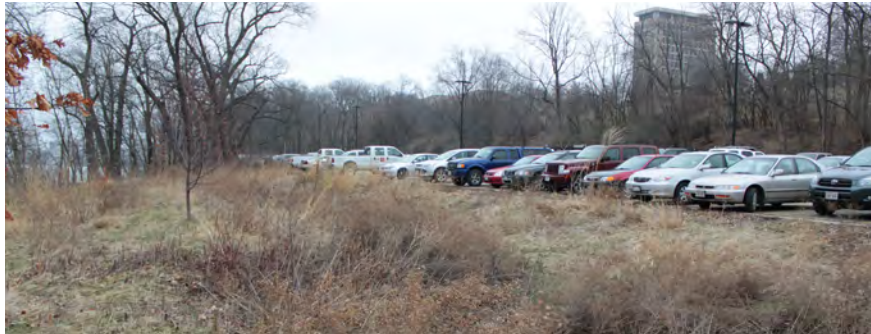
Lot 34 now dedicates the foot of Observatory Hill to surface parking.