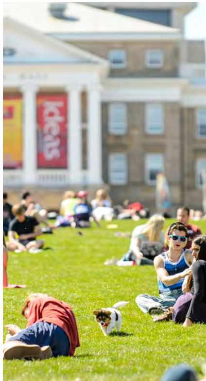
The careful balance of Bascom Hill – mixed-use buildings of architectural prominence surrounding and defining a well-designed and active open space.

The 2015 Campus Master Plan Update vision is to capture the best characteristics of our historic campus core, and extend and strengthen them throughout our evolving campus.