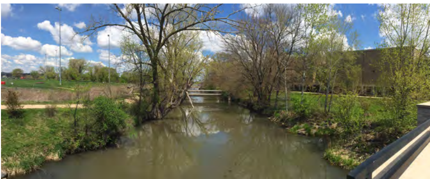
Willow Creek (Existing) – View looking north from Observatory Drive bridge.

The Willow Creek riparian zone should be restored by expanding the vegetative buffer to manage non-point source pollution. The removal of Easterday Lane will provide much needed green space for rain gardens to manage stormwater, cleansing and slowly releasing it to Willow Creek. Perched wetlands along the west side of the creek will intercept stormwater runoff from the Physical Plant Grounds Department service yard prior to it entering Willow Creek. Interpretive signage along boardwalks will educate students and visitors to the university’s cutting-edge stormwater management research.