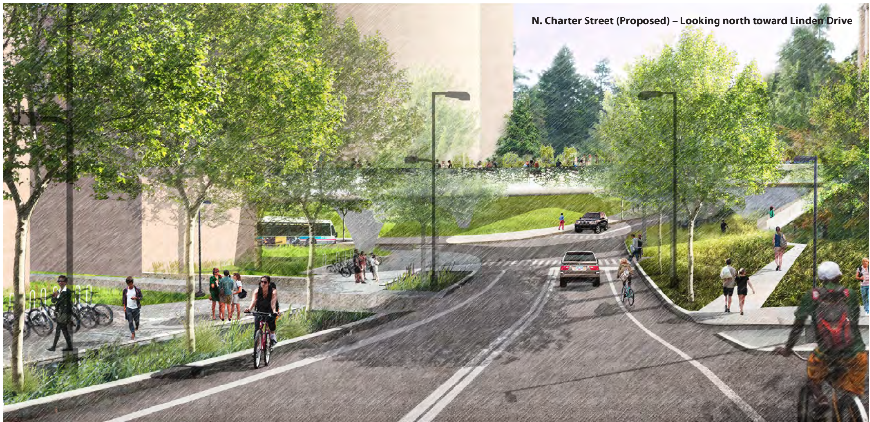
N. Charter Street (Proposed) – Looking north toward Linden Drive