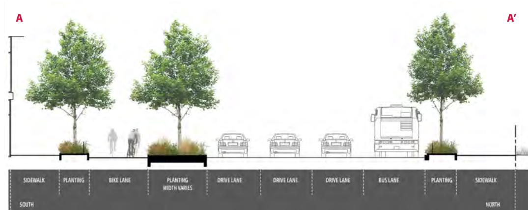
University Avenue (Proposed) – Cross-section (A-A')

The 2015 Campus Master Plan Update envisions a new University Avenue. Combining bike lanes into a separated two-way lane makes cycling more comfortable and safe for many users, and completes a regional off-street path. The transit lane and streetscape on the north will welcome the introduction of bus rapid transit service. The addition of landscaping within and at the edges will improve the appearance of our most visible transportation corridor. We understand University Avenue’s role in the region, so these changes will not reduce its vehicular capacity.