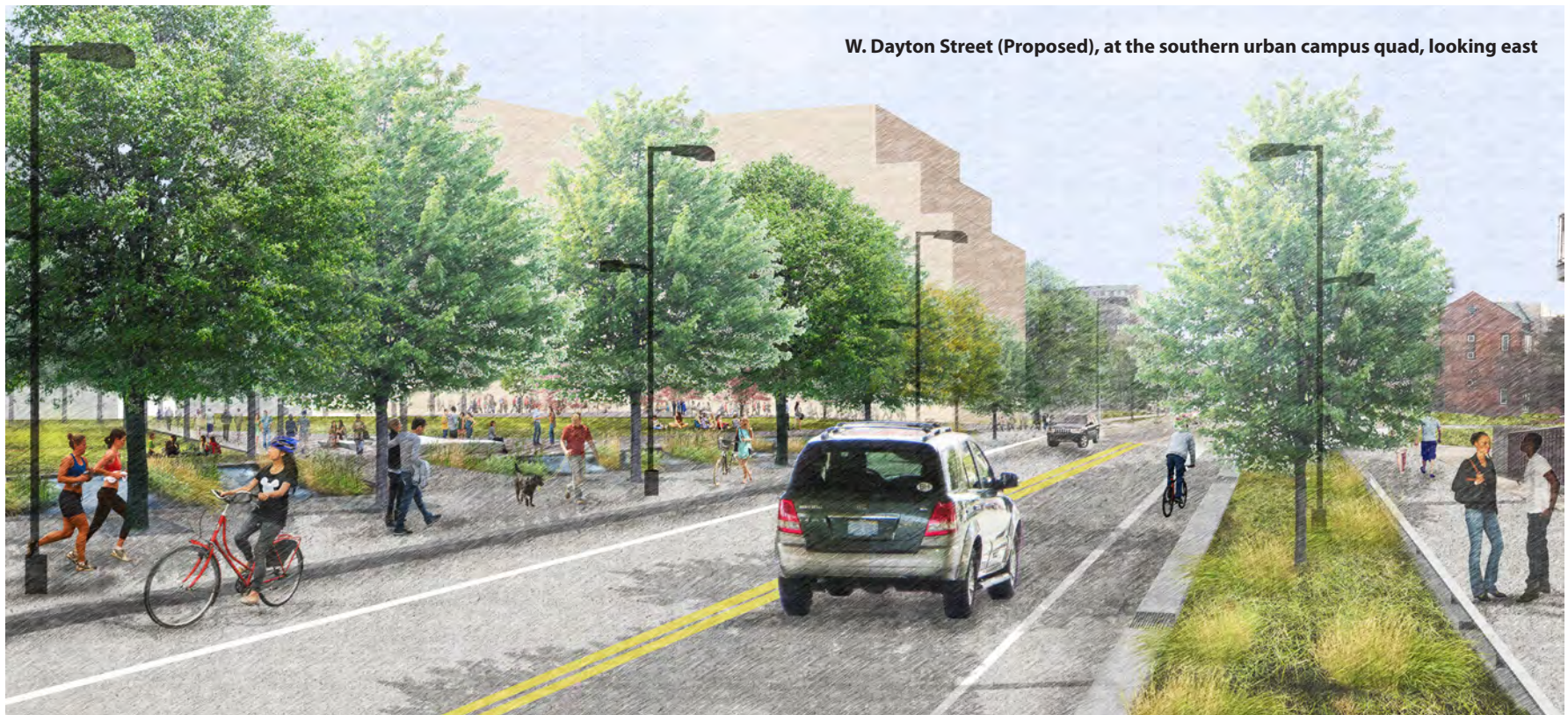
W. Dayton Street (Proposed), at the southern urban campus quad, looking east