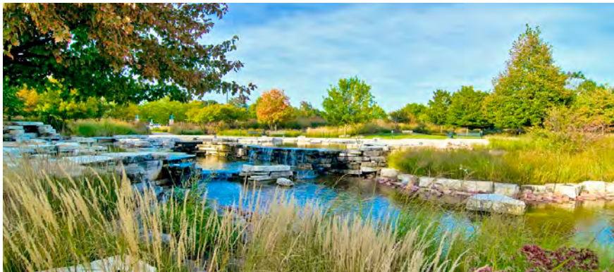
Lot 34 will be replaced by attractive and interactive engineered wetlands.