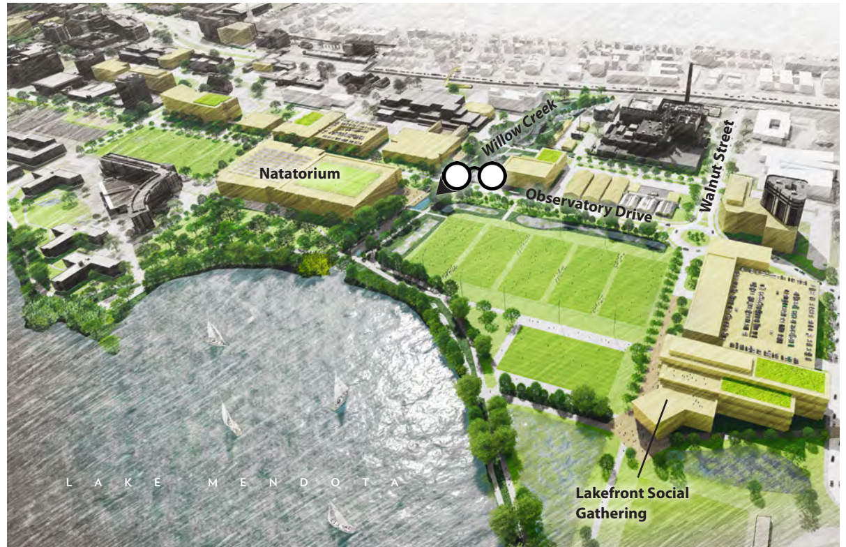
Willow Creek will become an attractive and engaging backbone for the stormwater management system in the near west agricultural and life science campus. Eye-level illustration top of next page.

Both the near west agricultural campus and the west health sciences campus have turned their backs on Willow Creek, an urban creek that is the only tributary on Lake Mendota on campus. This district of campus is poised for significant redevelopment, bringing an incredible opportunity to create a new campus vernacular of working landscapes and a revitalized creek, rooted in the agricultural and natural history of the area.