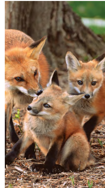
The preservation of the Lakeshore Nature Preserve – a place of respite for humans and habitat for flora and fauna.