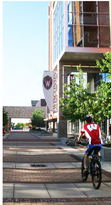
The comfort and safety of Library Mall and East Campus Mall – easy walking and biking with careful interaction with vehicles.