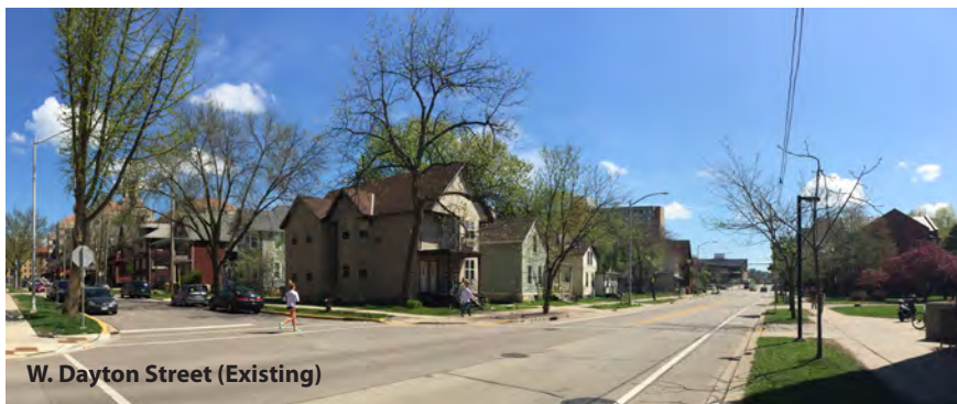
W. Dayton Street (Existing)

The southern urban campus today lacks the special outdoor places like Bascom Hill and the lakefront that make the historic campus so special. The 2015 Campus Master Plan Update seeks to create new gathering spaces along W. Dayton Street, near Educational Sciences, the Noland-Zoology block, and Union South. These new spaces will be connected to the heart of campus with a Henry Mall extension to Camp Randall Memorial Park, a reimagined and greener N. Charter Street, and a new N. Brooks Street pedestrian mall.