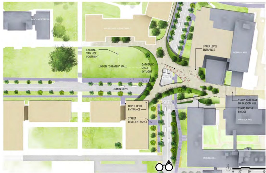
N. Charter Street and Linden Drive pedestrian bridge and landscape redevelopment. Eye-level illustration top of next page.

Vehicle parking will become more compact – most surface parking lots will be converted to above-ground or underground parking structures. Parking structures will reduce our environmental impact with incorporated renewable energy generating roofs and green roofs for stormwater management.