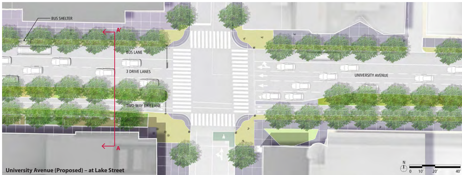
University Avenue (Proposed) – at Lake Street