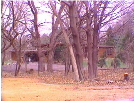
Assessor photo (approximately 15 years old)