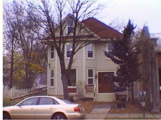
1911 – The Feeney Residence built in 1892 Assessor photo (approximately 15 years old)