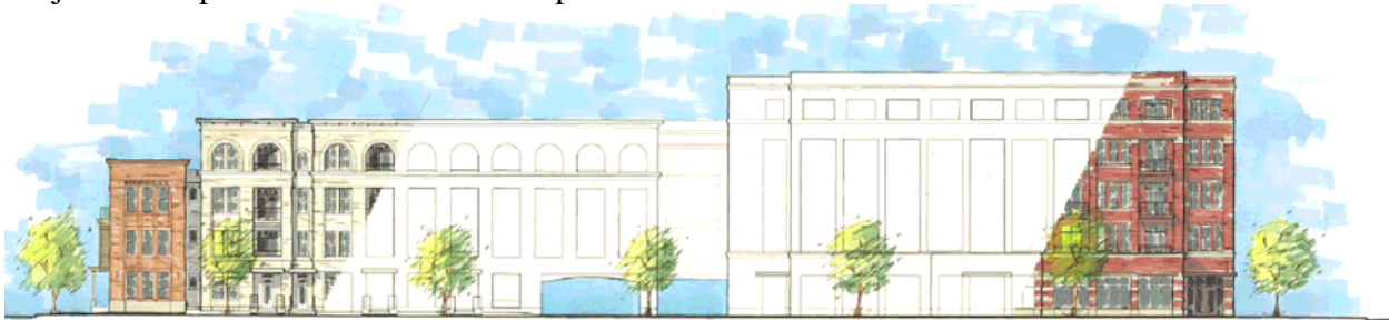
Conceptual Elevations Along Bedford

Project description: Mixed-Use development: