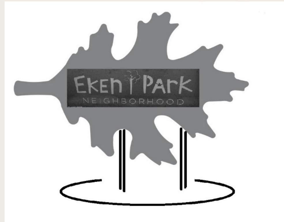
Future Welcome Sign