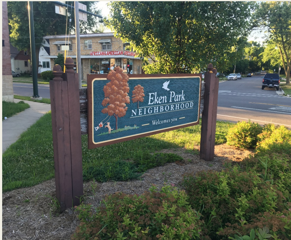
Current Welcome Sign

Funded by City of Madison DPCED "Neighborhood Grant" ($7500)