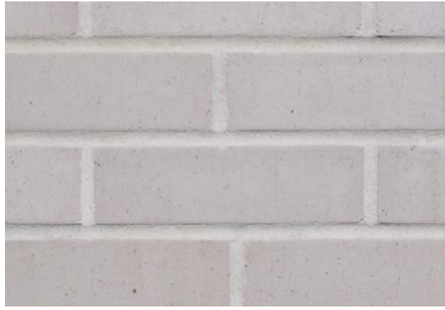
MODULAR BRICK - LIGHT GRAY