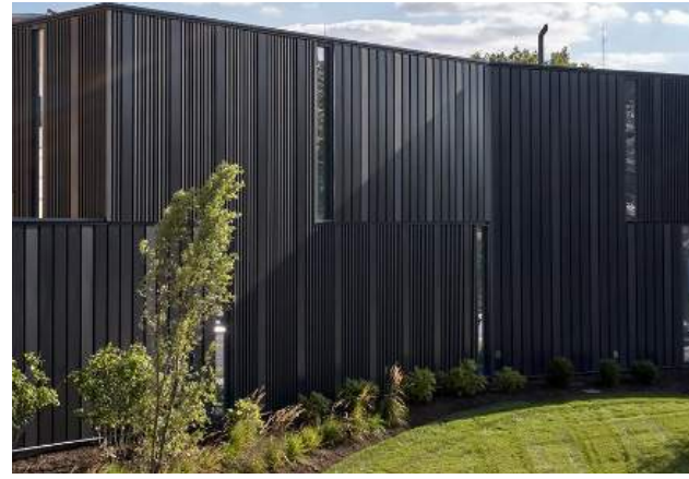
TEXTURED METAL PANEL