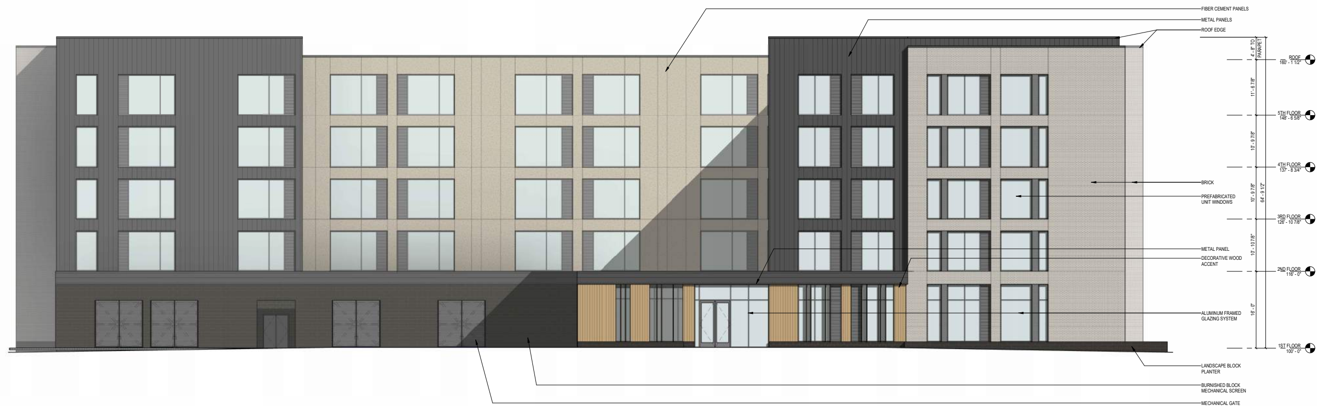
② SOUTH ELEVATION 1/8" = 1'-0"