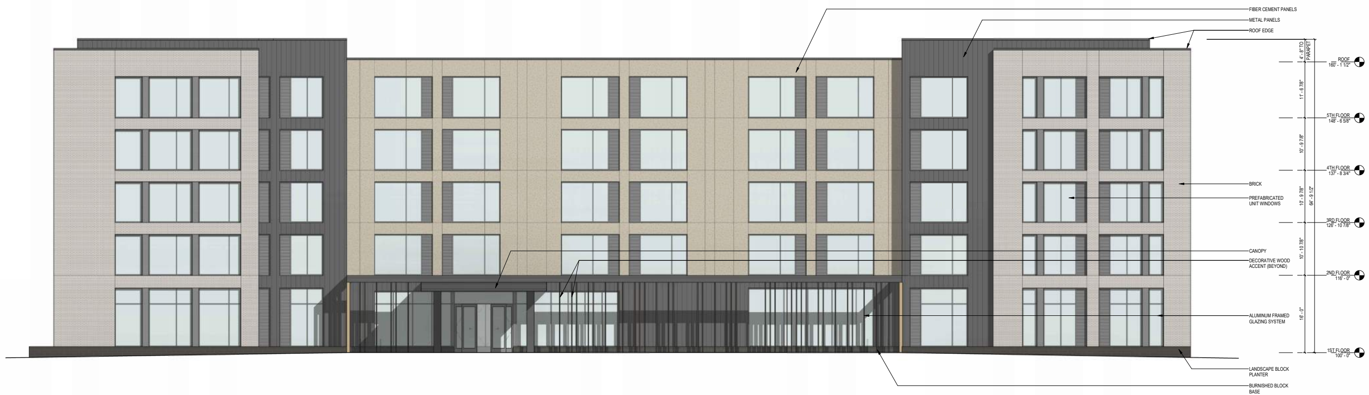
① NORTH ELEVATION 1/8" = 1'-0"