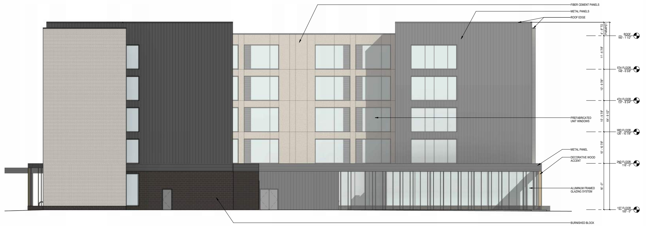
② WEST ELEVATION 1/8" = 1'-0"