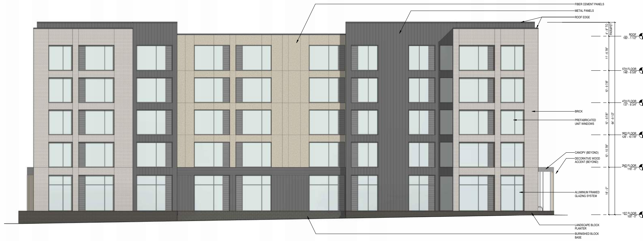
① EAST ELEVATION 1/8" = 1'-0"