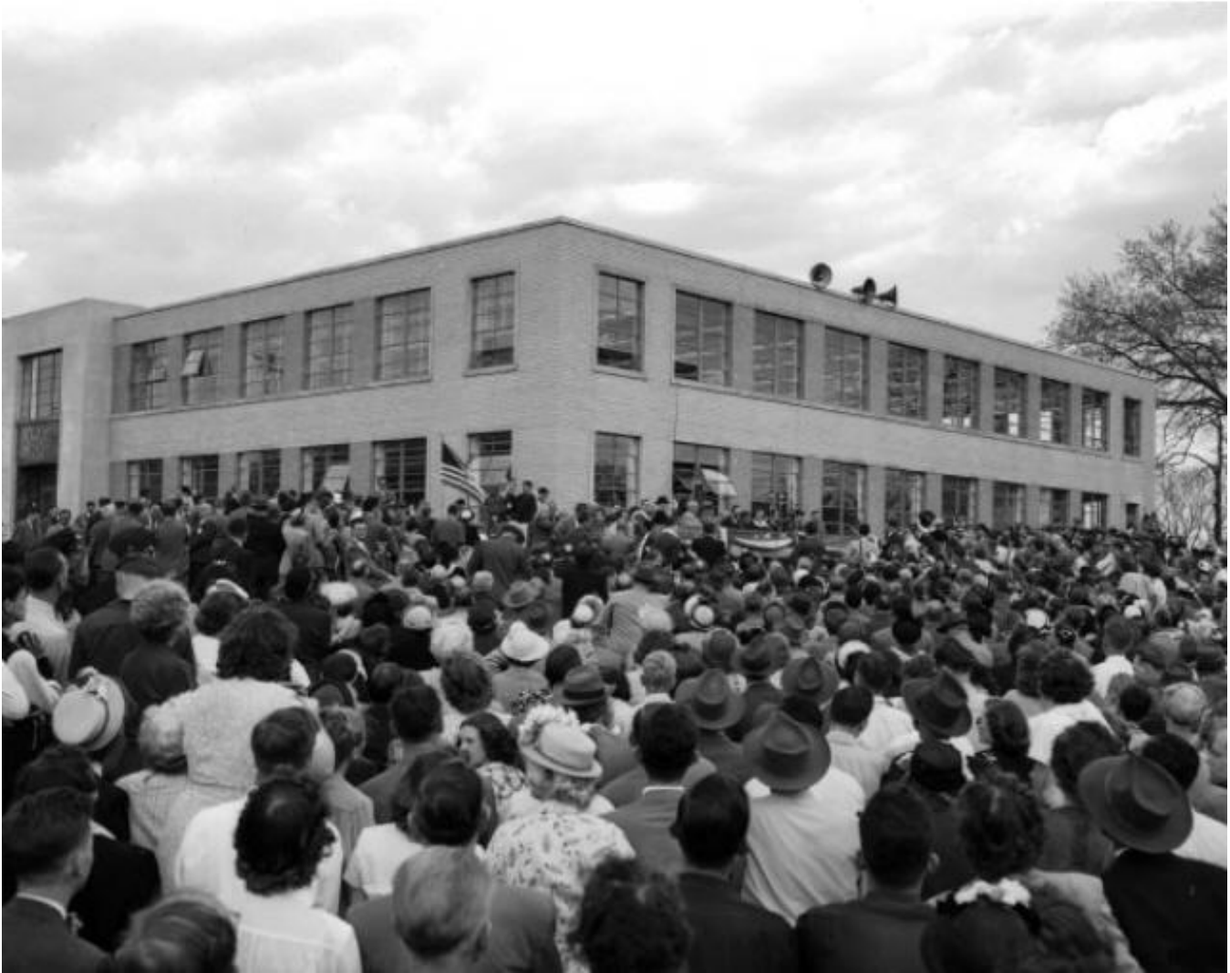
Crowd attending Filene House dedication May 14, 1950. Photo to northeast from southwest.