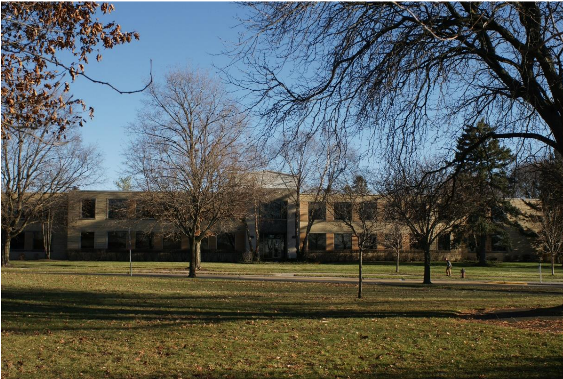
Filene House West Elevation. Photo from Filene Park on West 11.25.22.