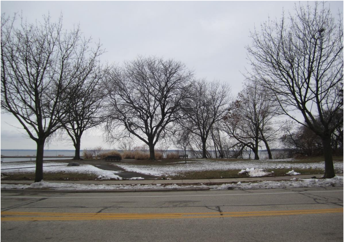
View to West (Filene Park, Lake Mendota) from Filene House. Photo 12.12.22.