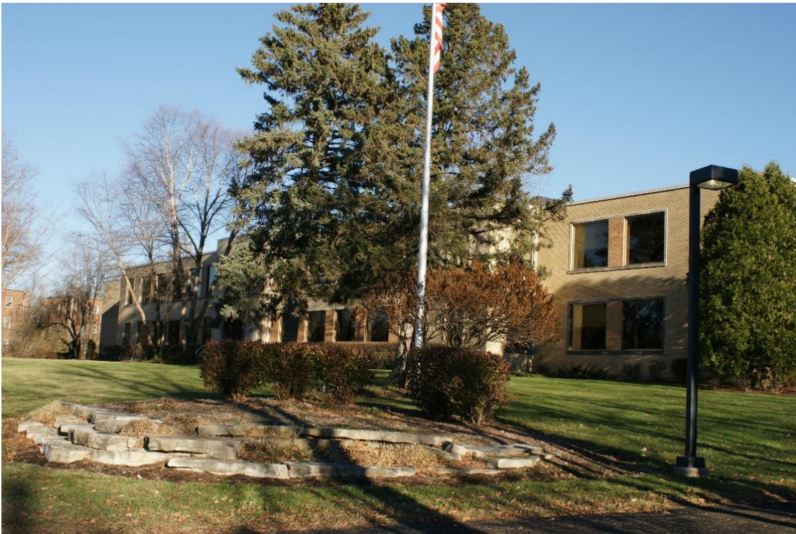
Filene House West Elevation, Photo from Southwest 11.25.22.