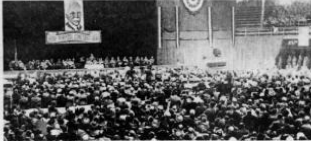
President Addresses Crowd of 10,000 at Fieldhouse