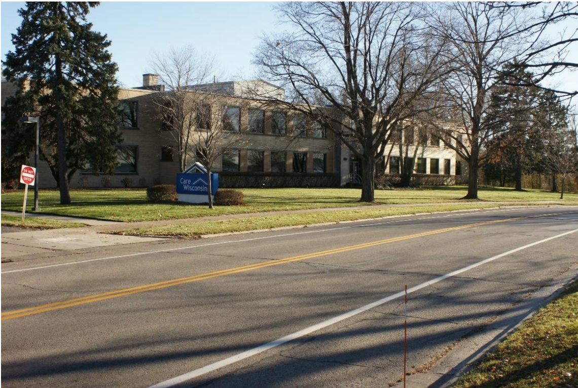
Filene House West Elevation, Photo from Northwest 11.25.22.