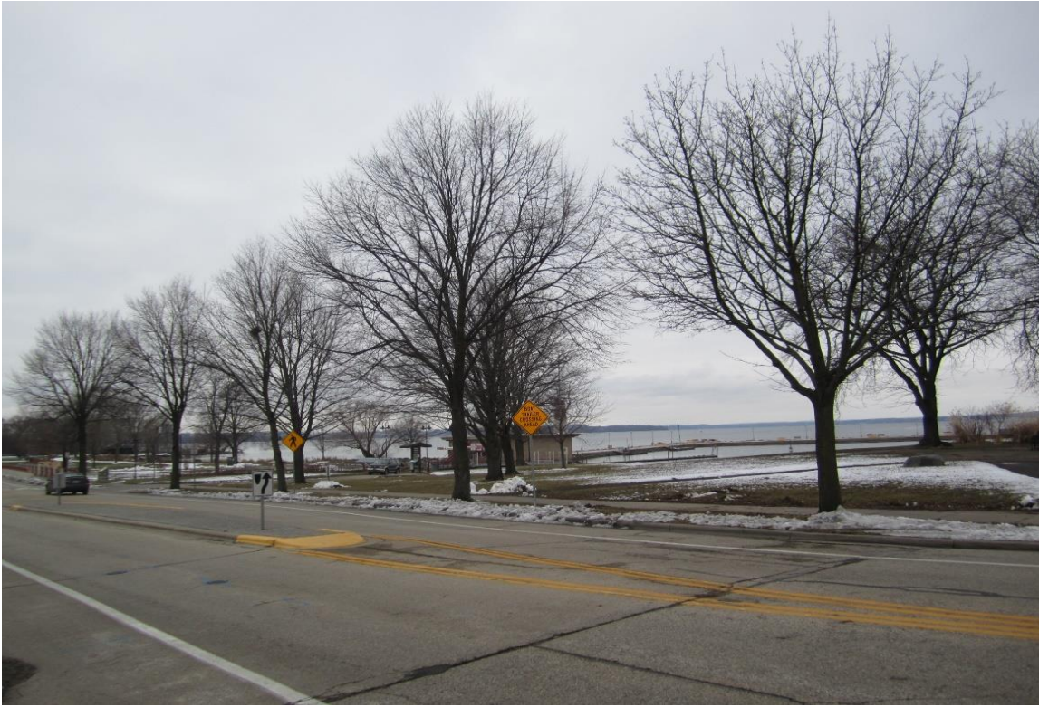
View to Southwest (Tenney Locks, Lake Mendota) from Filene House. Photo 12.12.22