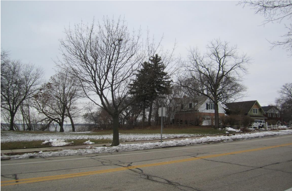
View to Northwest (Filene Park, Single-Unit Houses) from Filene House. Photo 12.12.22.