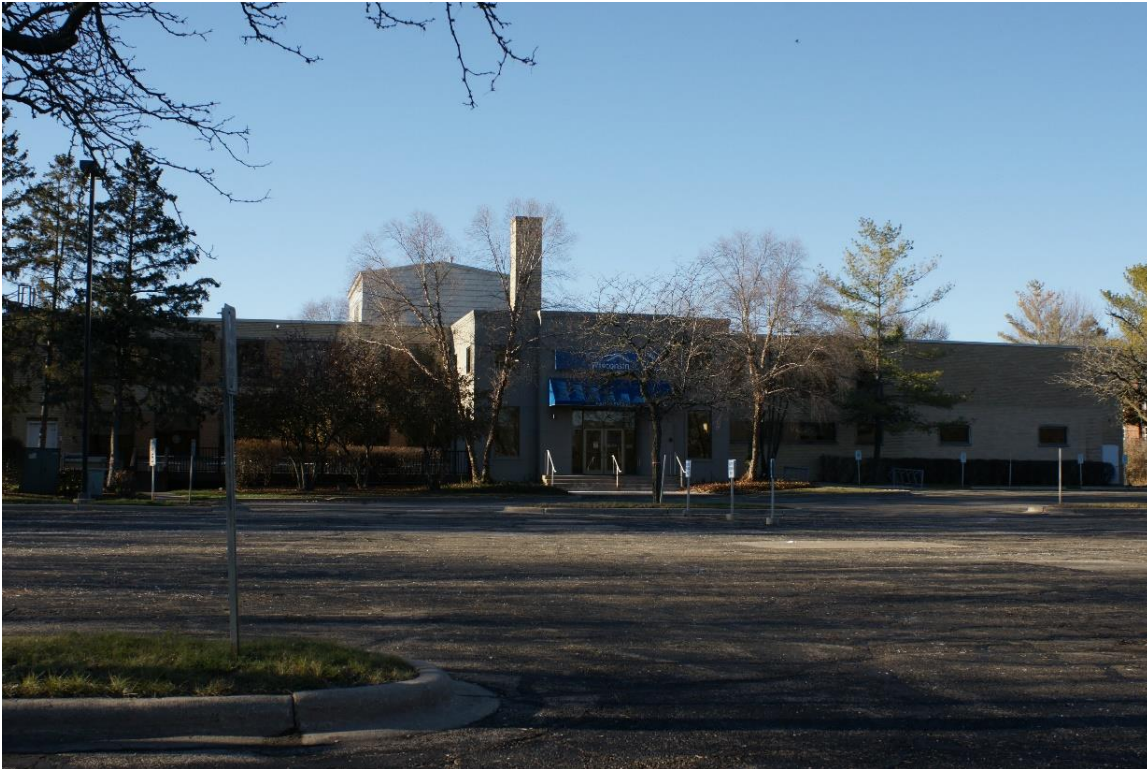
Filene House East Elevation. Photo from East 11.25.22.