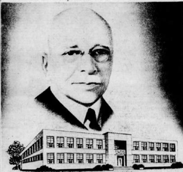
A symbol of progress in the Credit Union movement is pictured here, in an architect's drawing of the Credit Union National Association's new national headquarters and a photograph of the organization's founder, the late Edward A. Filene...