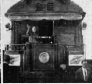
Mr. Truman Waves Farewell at Train Leaves