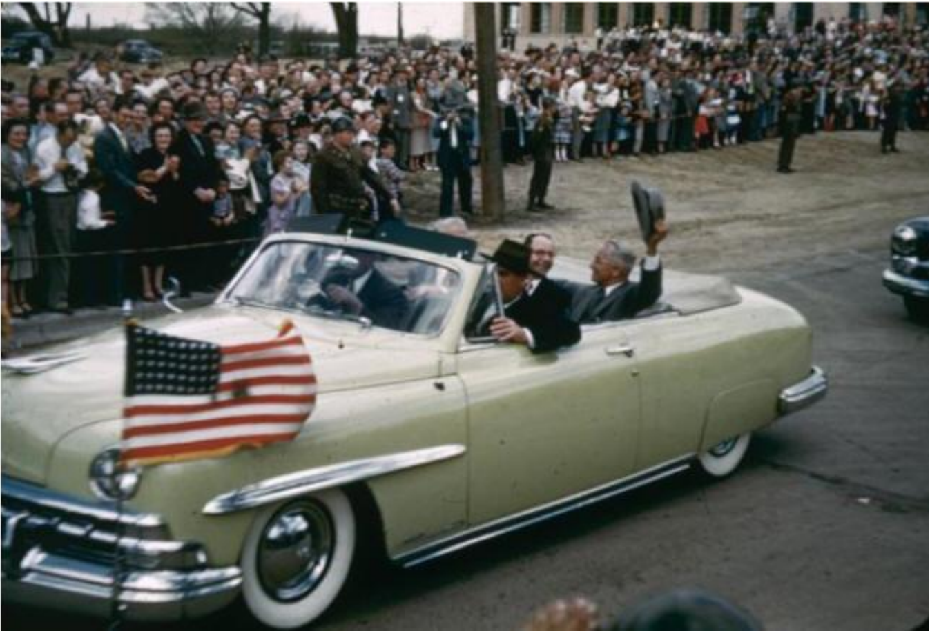
President Truman leaving cornerstone-laying ceremony at Filene House, May 14, 1950.