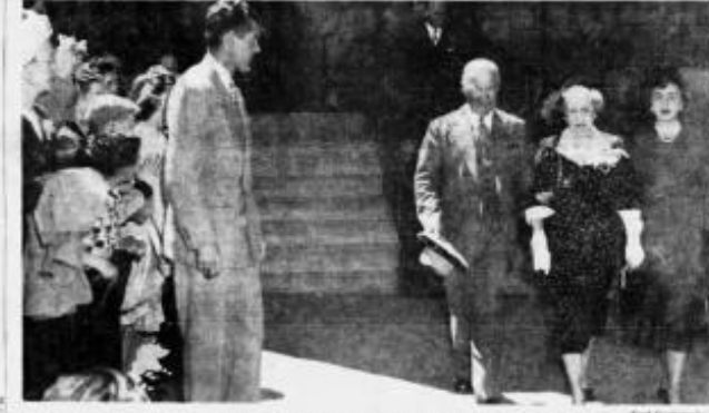
Pres. Truman, Mrs. Truman, and Margaret Shows Leaving Grace Episcopal Church After Services Sunday