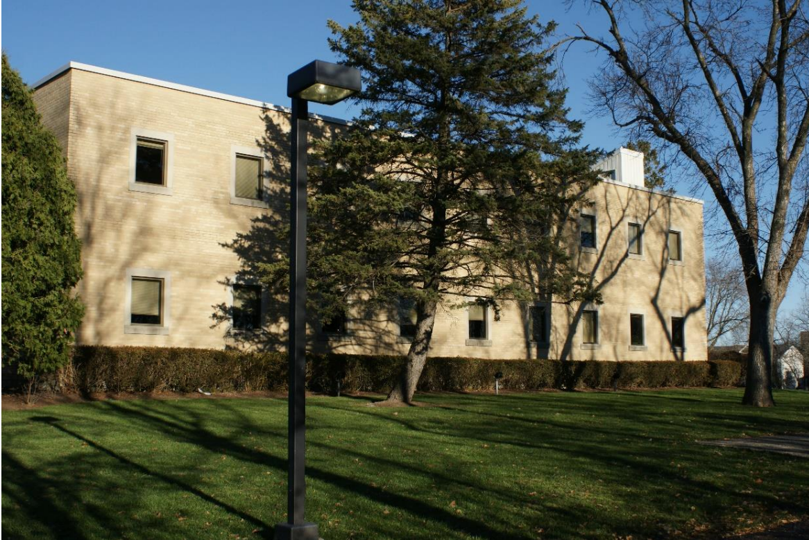
Filene House South Addition (1966). Photo from South 11.25.22