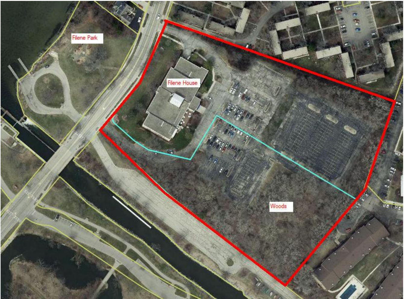
Aerial Photo 2022. Red outline shows the entire 8.19-acre parcel. Cyan line distinguishes two tax parcels included under a single legal description.