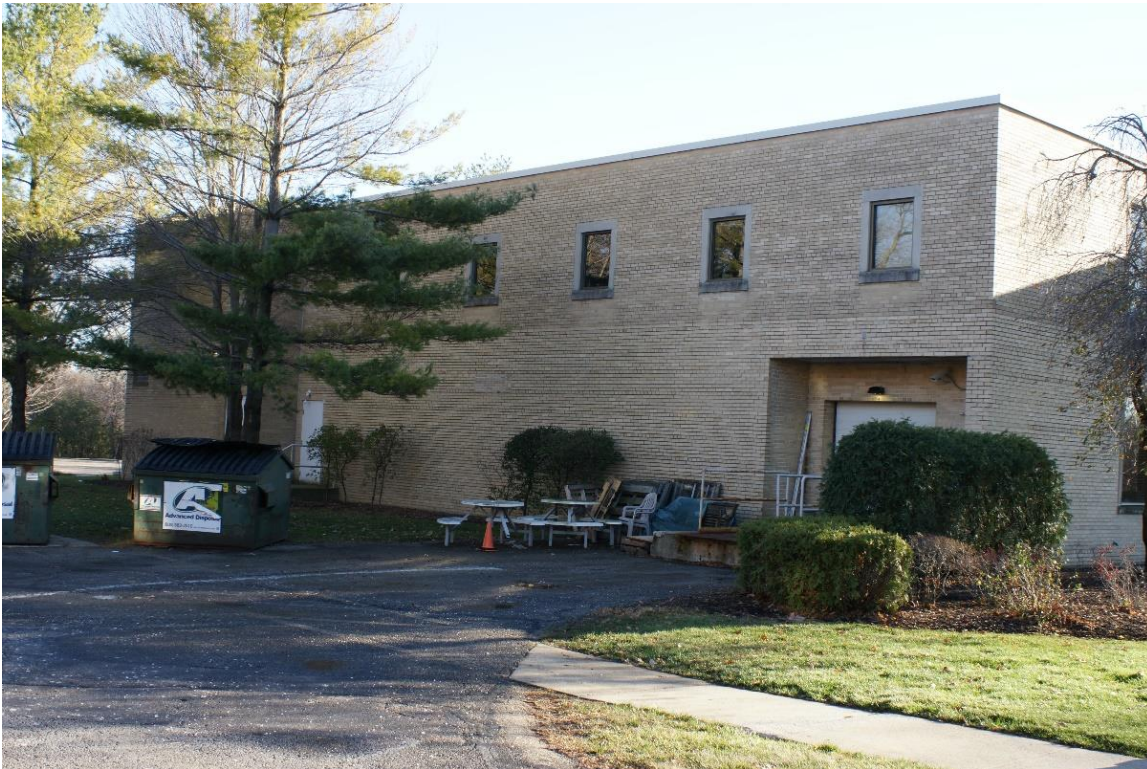
Filene House North Addition (1966).