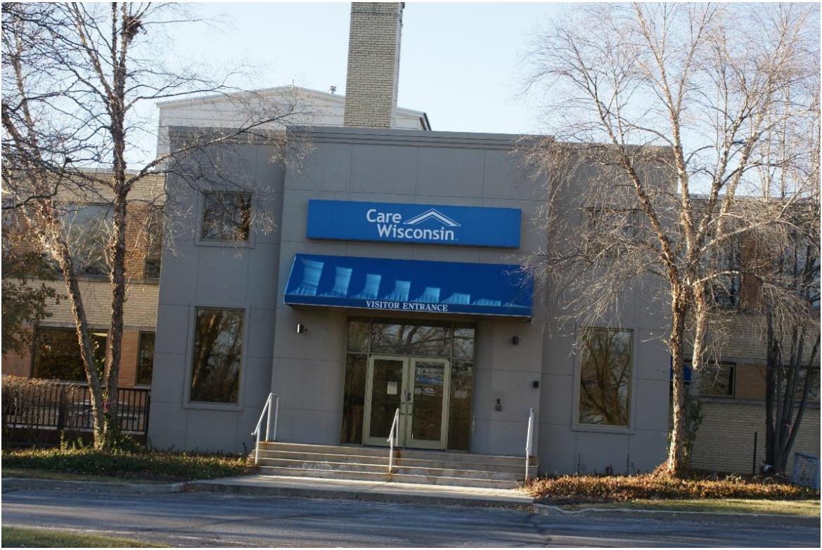
Filene House East Addition (2000). Photo from East 11.25.22.