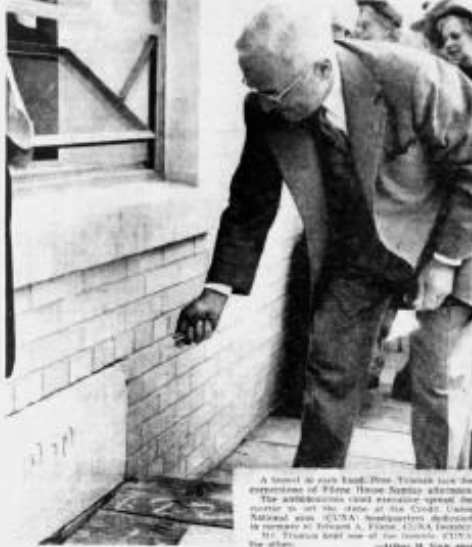
A stone to each hand, Pres. Truman laid the cornerstone of Filene House Sunday afternoon. The ambidextrous chief executive opened the corner to set the stone of the United States National Bank, CUNA headquarters, dedicated in memory of Edward A. Filene, CUNA founder. Mr. Truman kept one of the tools, CUNA officials said.