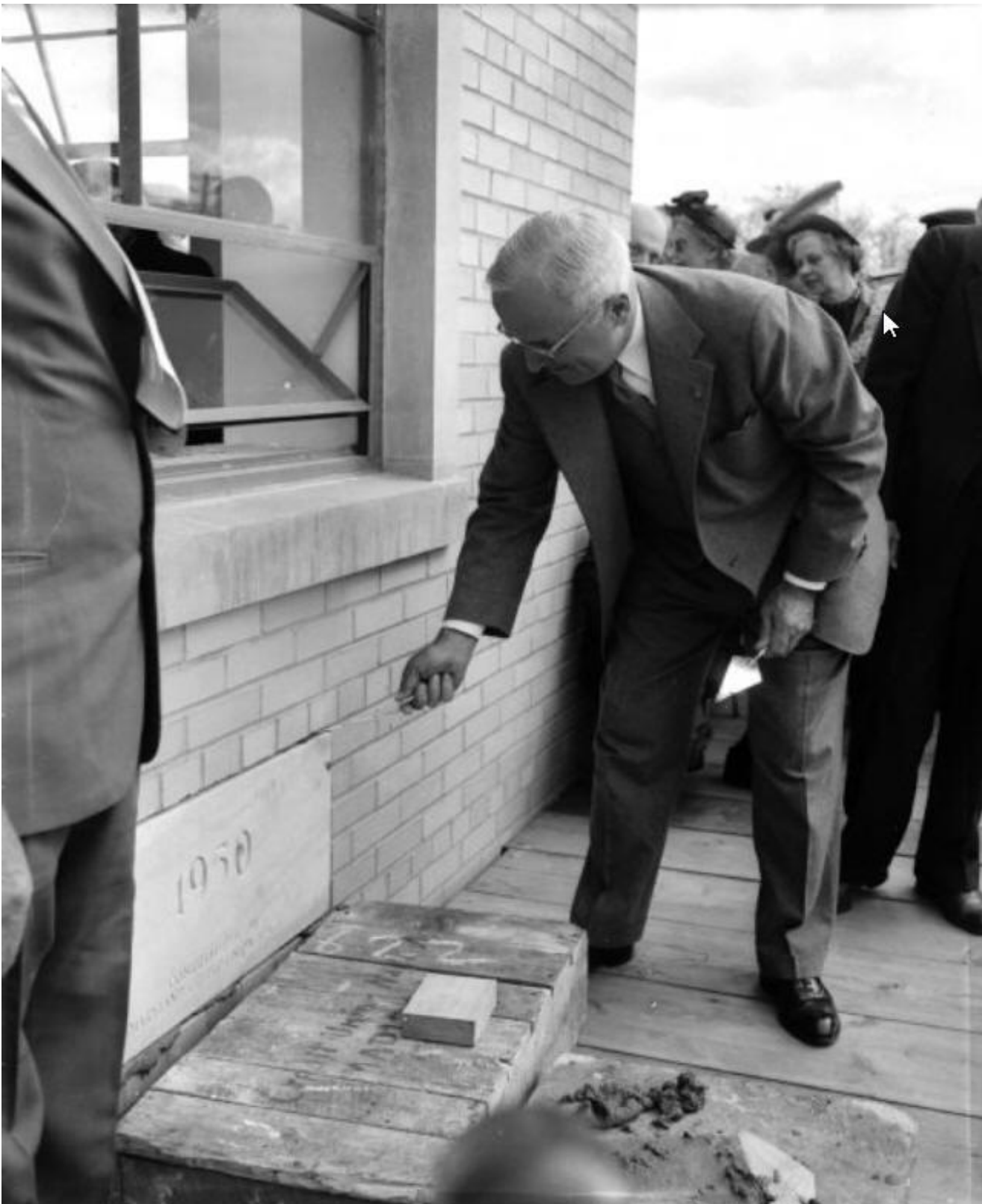
President Truman laying cornerstone at Filene House May 14, 1950.