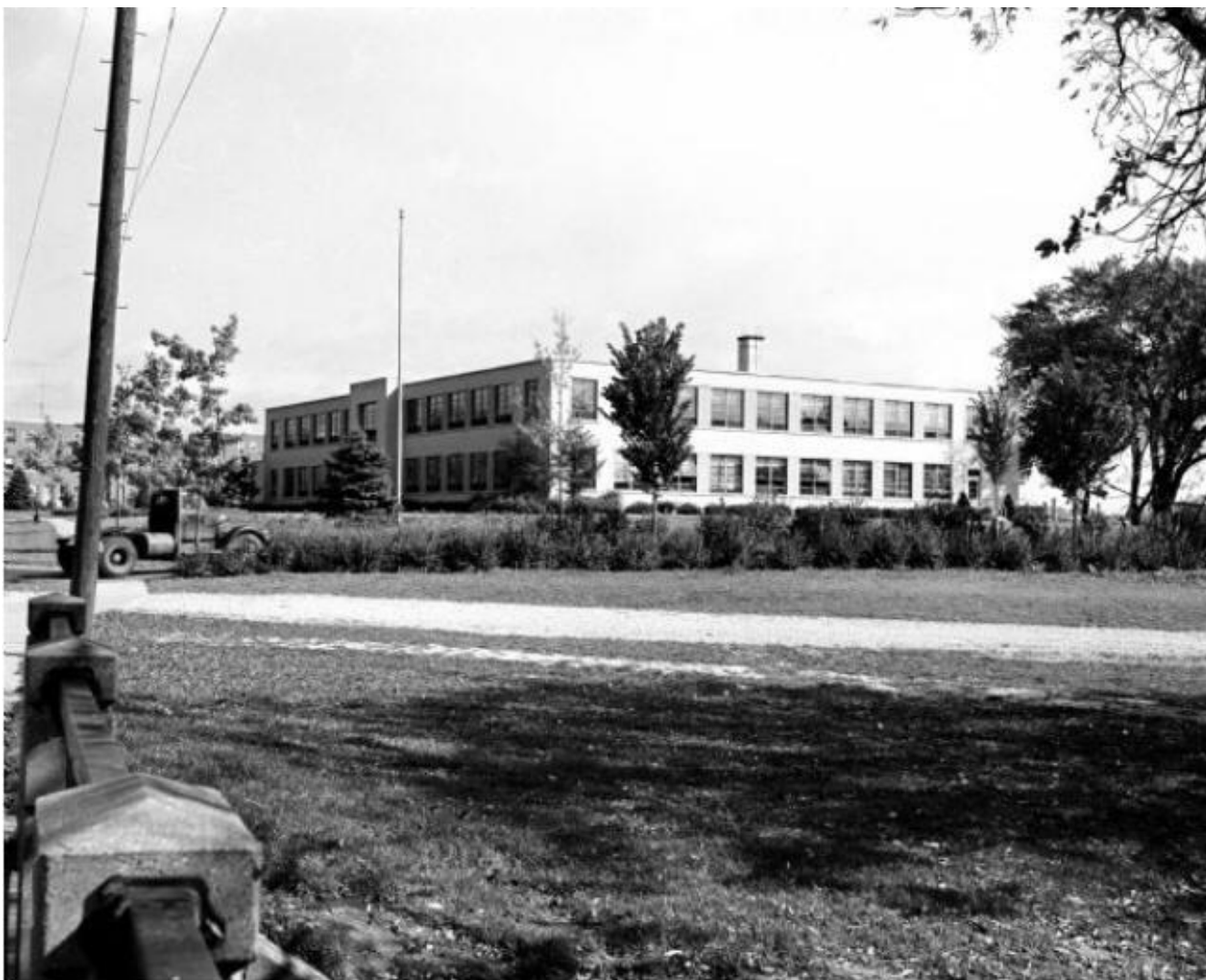
Filene House, view toward northeast from southwest at bridge over Yahara River. Photo October 13, 1954 by Arthur Vinje. SOURCE: State Historical Society of Wisconsin, Image ID 109633.