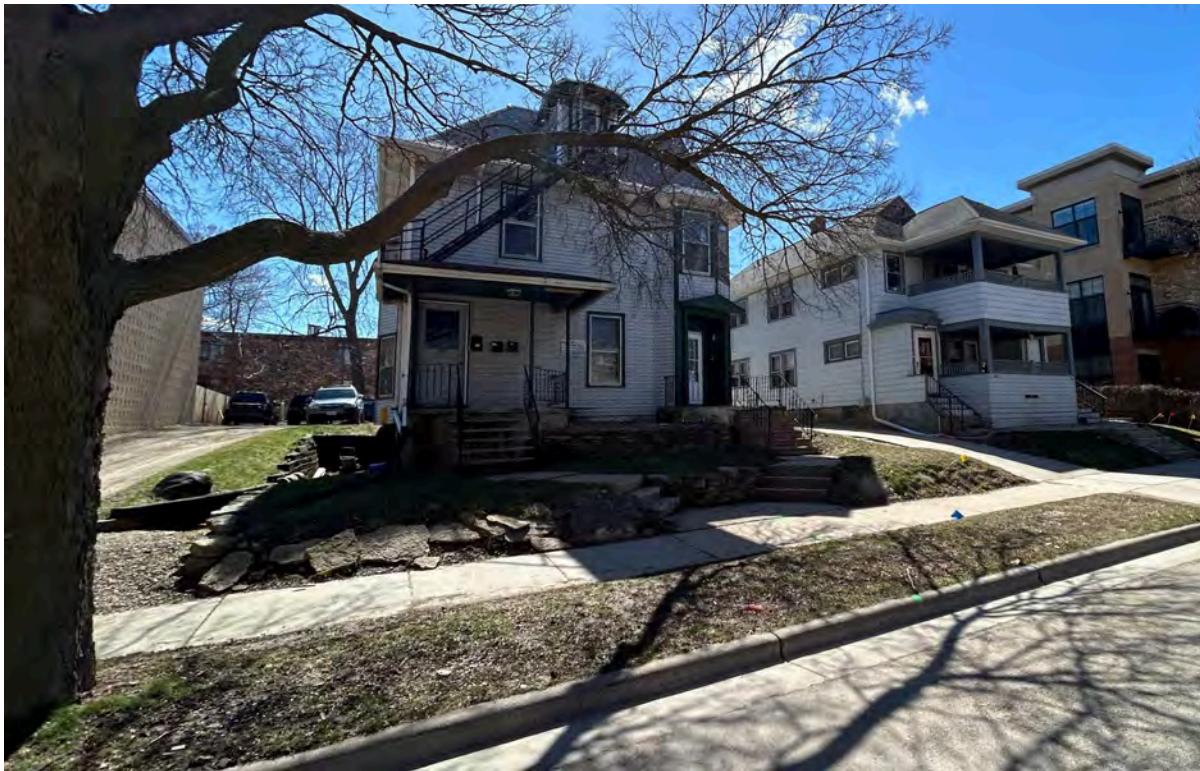
Above: 519 W Main St (left), 521 W Main St (Right)