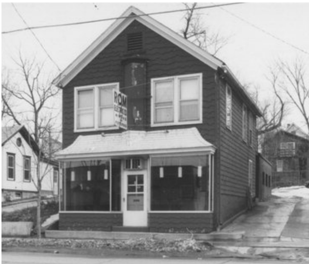
1984 Survey Photo

The signage column was removed at some point in recent history, but had once contained the signage for Badger Electric, which moved into the building in the early mid-twentieth century. When ROM Electric took over the business, they painted over the signage and installed a projecting sign to the front of the column. The current proposal is to reconstruct the historic signage column and then install new signage.