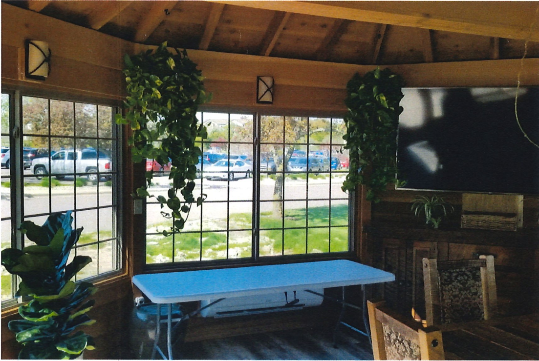
INTERIOR VIEW TO EXTERIOR