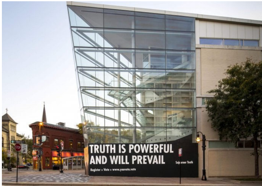
YOU VOTE 2020 Mural Text: Sojourner Truth Installation: Madison, Wisconsin, USA, 2020 © 2020 Jenny Holzer, member Artists Rights Society (ARS), NY

Artwork by internationally acclaimed artist Jenny Holzer has a place in the permanent collection of the