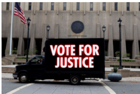
YOU VOTE 2020 Photo provided: © 2020 Jenny Holzer, member Artists Rights Society (ARS), NY

message about the importance of voting, issue awareness and empowerment. The artwork is appearing in a variety of different mediums tied to the arts, academia and sports worlds.