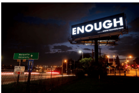
"Enough" billboard in Milwaukee. Provided by YOU VOTE 2020 by Jenny Holzer www.youvote.vote

The message — in all locations — boils down to a basic nonpartisan instruction: Go vote.