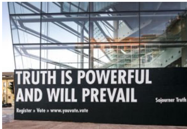
YOU VOTE 2020 Mural Text: Sojourner Truth Installation: Madison, Wisconsin, USA, 2020

And the large-scale mural at MMoCA features a quote by abolitionist and women's rights activist Sojourner Truth: "Truth is powerful and will prevail."