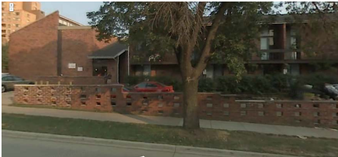
Google street view image of 415