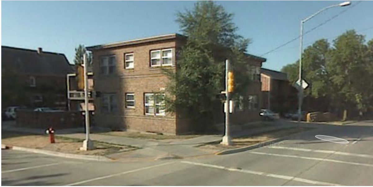
Google street view image of 226