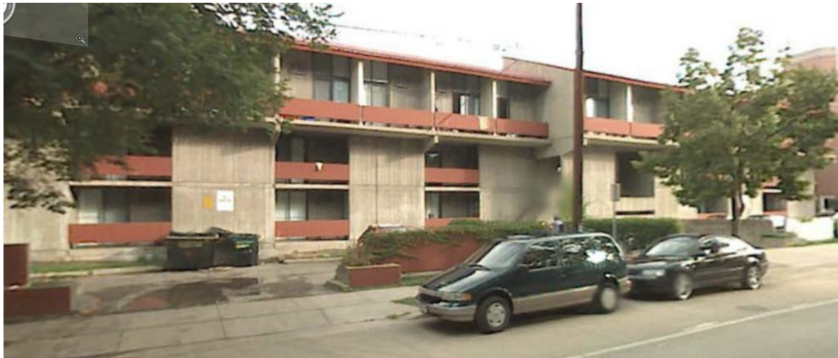
Google street view image of 424