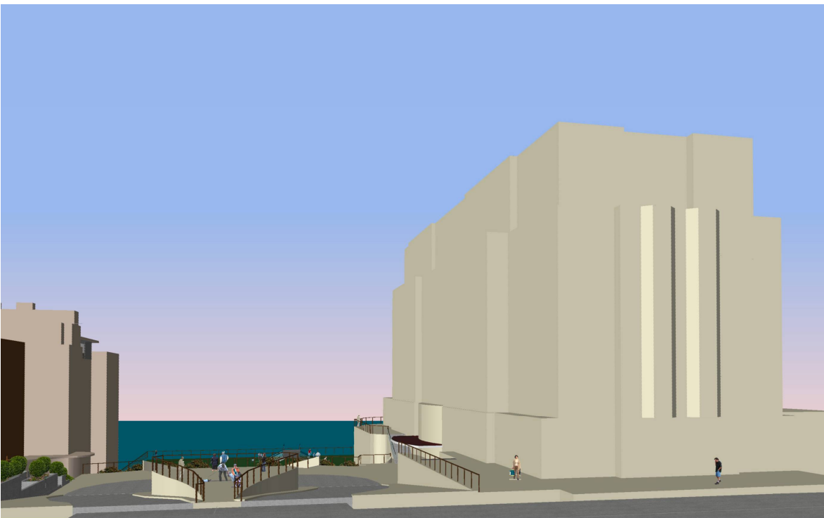
This one from same viewpoint with 35 mm focal length lens (closest to human vision)