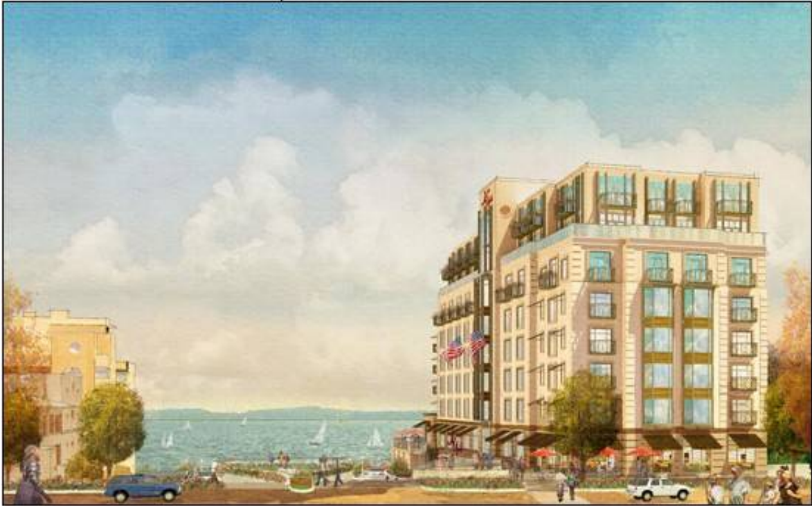
New Hammes Rendering – Another one from 19' above the street with tweaked perspective