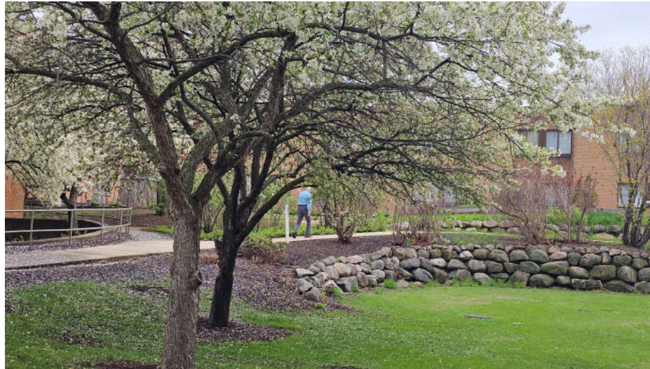
Attractive trees, chapel, and resident gardens back onto the Village Green that faces the Bistro and Assisted Living rooms.