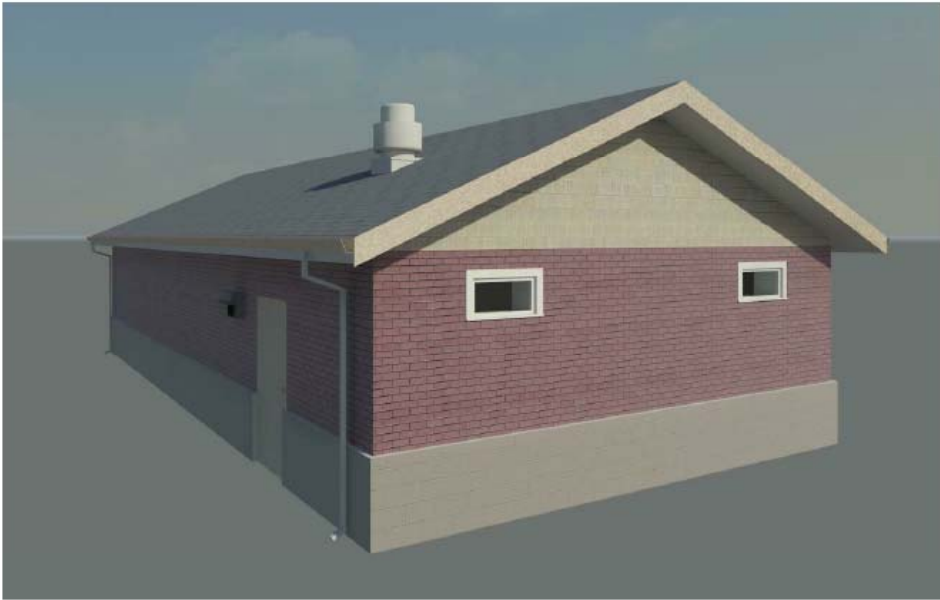
3D VIEW 1 - OPTION 2