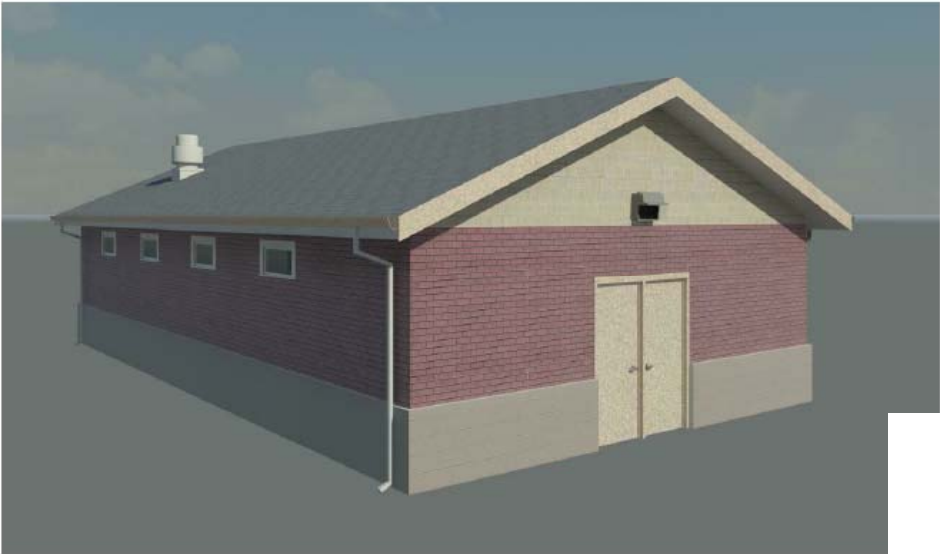
3D VIEW 2 - OPTION 2