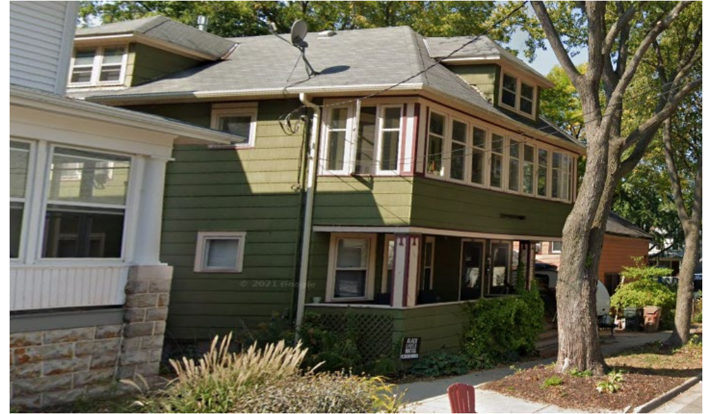
508 S Ingersoll