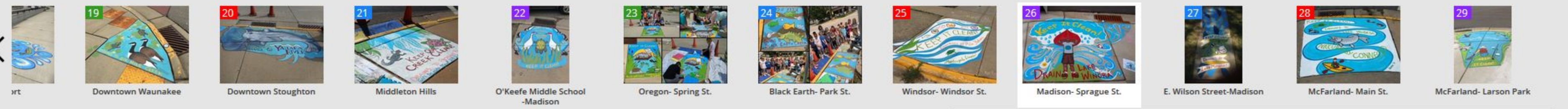
1rt 19 Downtown Waunakee 20 Downtown Stoughton 21 Middleton Hills 22 O'Keefe Middle School -Madison 23 Oregon- Spring St. 24 Black Earth- Park St. 25 Windsor- Windsor St. 26 Madison- Sprague St. 27 E. Wilson Street-Madison 28 McFarland- Main St. 29 McFarland- Larson Park