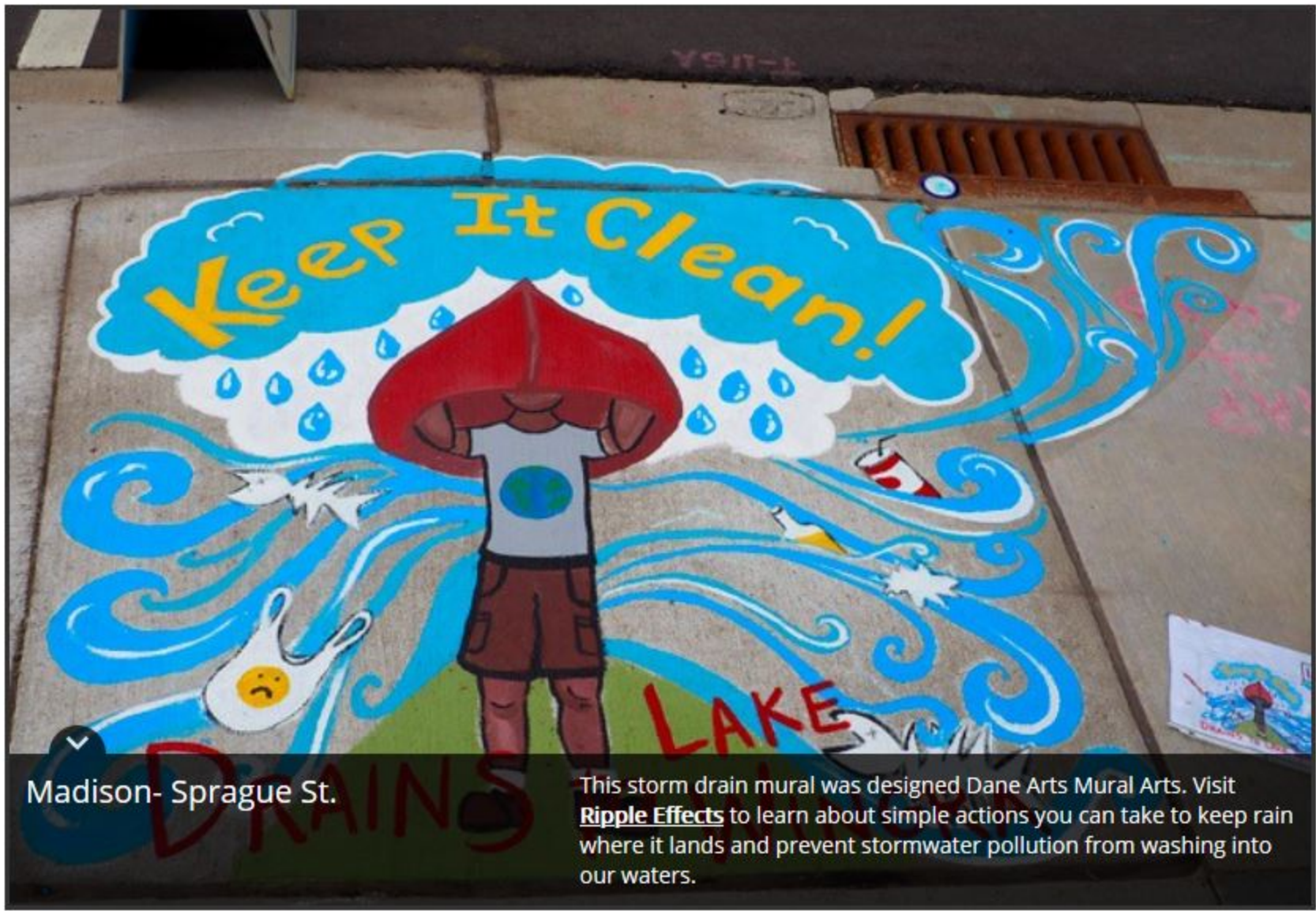
Madison- Sprague St.

This storm drain mural was designed Dane Arts Mural Arts. Visit Ripple Effects to learn about simple actions you can take to keep rain where it lands and prevent stormwater pollution from washing into our waters.