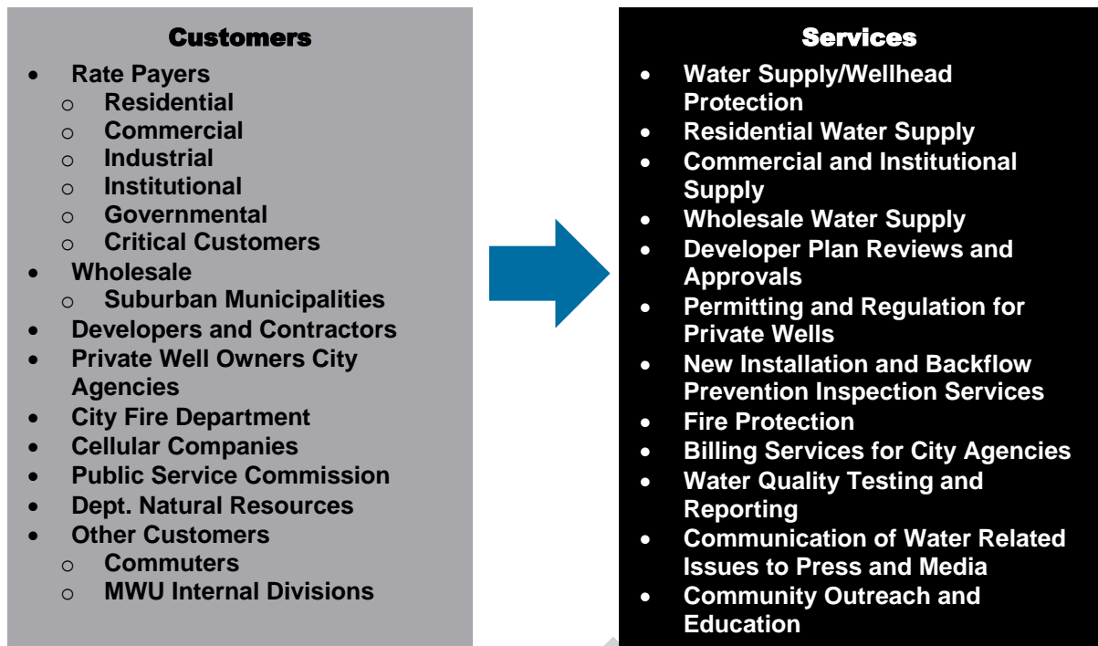
Figure 6 MWU Customers and Services Provided

Customer expectations can be articulated in the following service attributes: