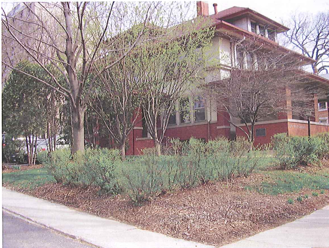
120 W Gorham Street