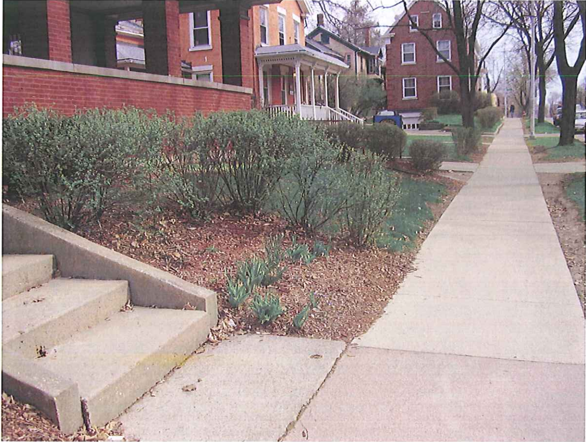
Knee wall materials: Unilock Estate Wall: Sienna