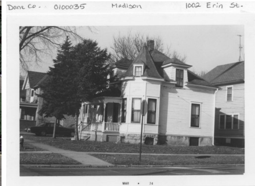
WHS Photo from 1974

Staff Recommendation: Staff recommends a finding of historic value related to the vernacular context of Madison's build environment, but the building itself is not historically, architecturally, or culturally significant.