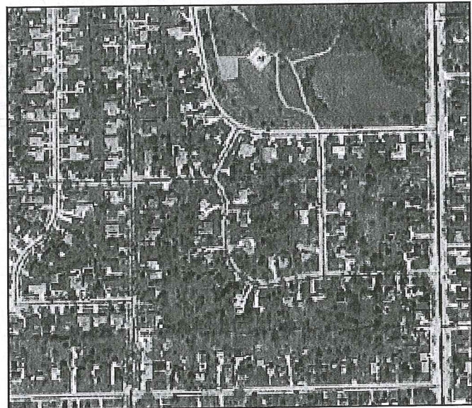
Hyperspectrally derived ash classification GIS layer in northwest Milwaukee (top) and the south central portion of the city (bottom).

*LIDAR: Light Detection and Ranging, from nasa.gov : A Lidar transmits coherent laser light, at various visible or NIR (Near-IR) wavelengths, as a series of pulses (100s per second) to the surface, from which some of the light reflects. In this sense, it is similar to radar. Travel times for the round-trip are the measured parameter. 🍃