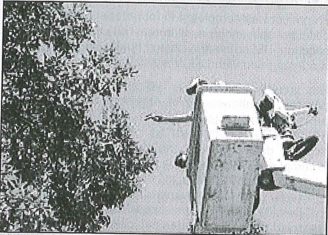
Field spectral data collection (ash)