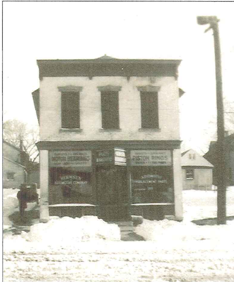
831 WILLIAMSON STREET CIRCA 1933