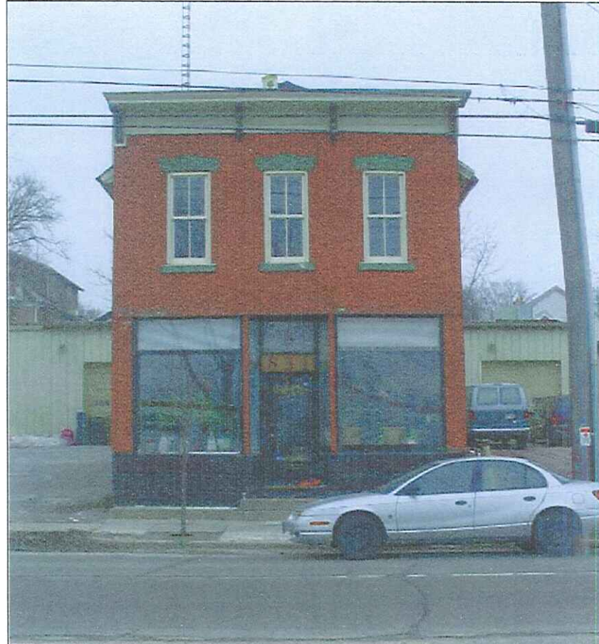
831 WILLIAMSON STREET CURRENT

74 SOUTH HENRIE BLVD. MADISON, WI 53705 TABLES 1, 2, 3, 4, 5, 6, 7, 8, 9, 10, 11, 12, 13, 14, 15, 16, 17, 18, 19, 20, 21, 22, 23, 24, 25, 26, 27, 28, 29, 30, 31, 32, 33, 34, 35, 36, 37, 38, 39, 40, 41, 42, 43, 44, 45, 46, 47, 48, 49, 50, 51, 52, 53, 54, 55, 56, 57, 58, 59, 60, 61, 62, 63, 64, 65, 66, 67, 68, 69, 70, 71, 72, 73, 74, 75, 76, 77, 78, 79, 80, 81, 82, 83, 84, 85, 86, 87, 88, 89, 90, 91, 92, 93, 94, 95, 96, 97, 98, 99, 100