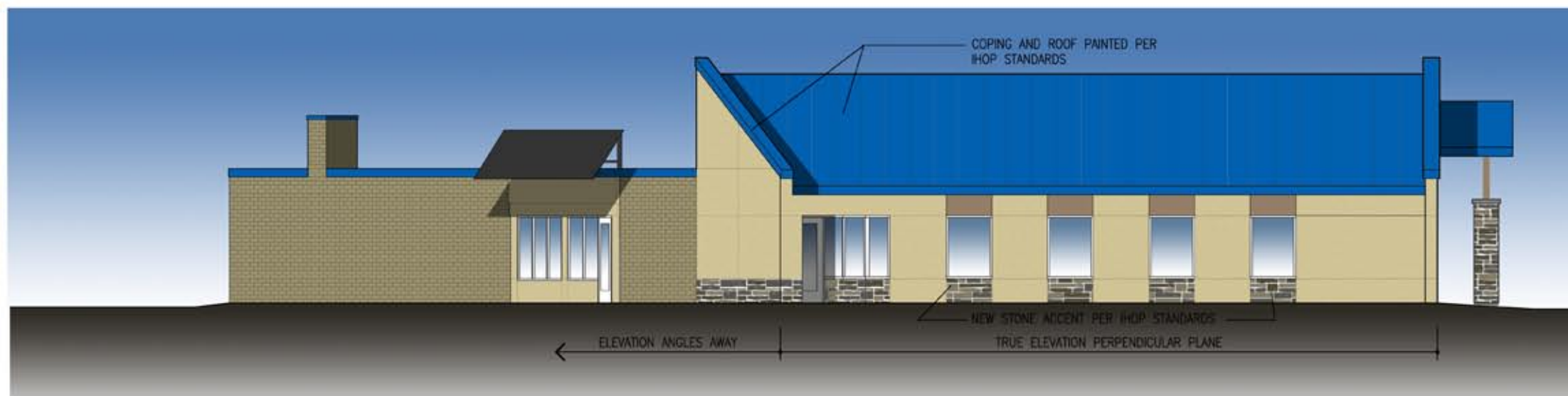
1 NORTH ELEVATION 3/16"=1'-0"