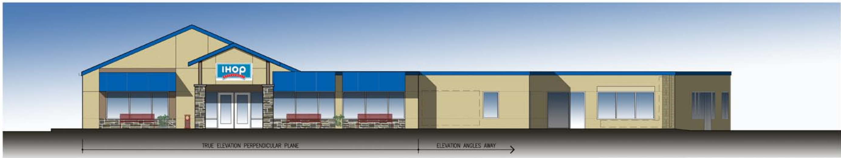
3 WEST ELEVATION 3/16"=1'-0"