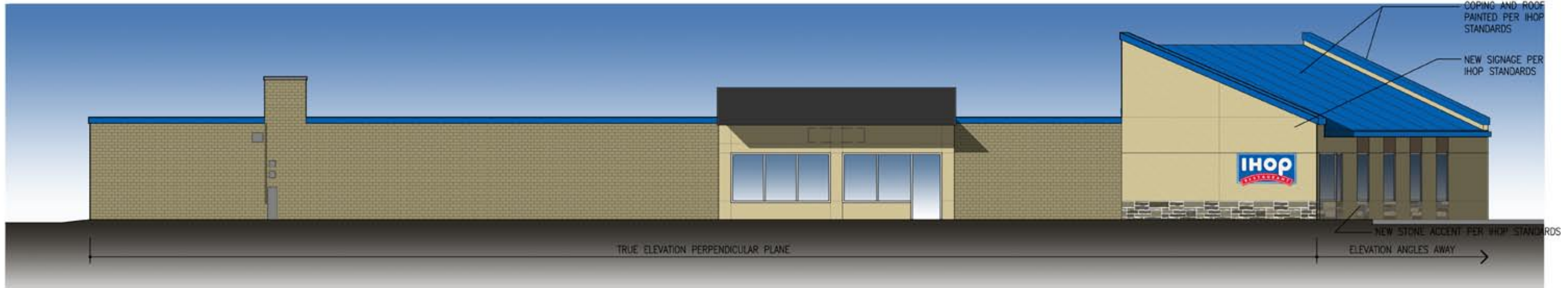
2 EAST ELEVATION 3/16"=1'-0"