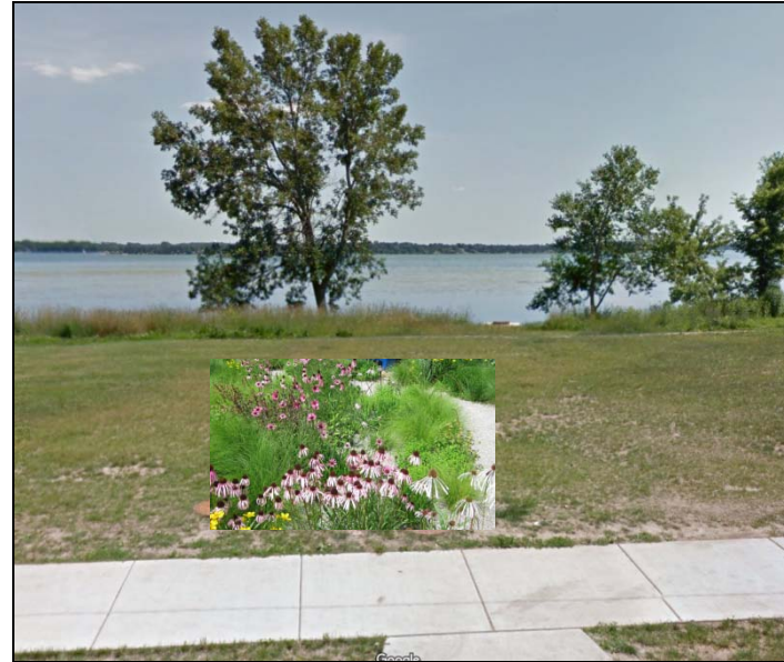
Down Periscope - Buffalo Bayou Park