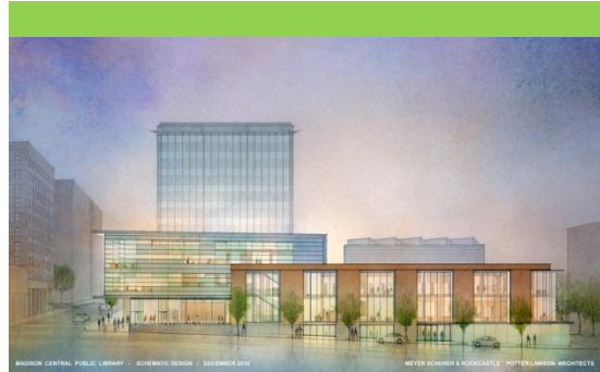
Madison Central Public Library Madison, Wisconsin

Prepared by: Facilities & Sustainability Department Staff , Dept. of Public Works, Engineering Division, City of Madison