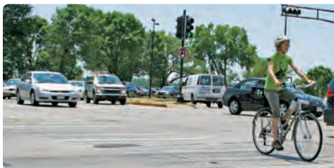
Bicyclist in traffic, Dane County

“I have ridden my bike to work, but it’s scary because there’s very little shoulder...I don’t trust the drivers.”