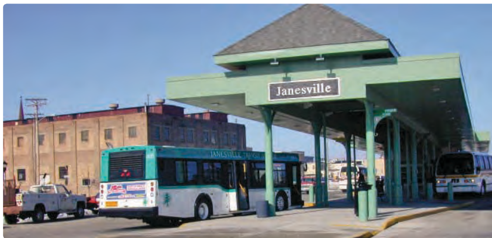
Janesville, Rock County

Without funding for transit capital needs, Wisconsin’s transit systems will be faced with increased annual maintenance and operating costs, and they may be unable to replace their aging buses and facilities.