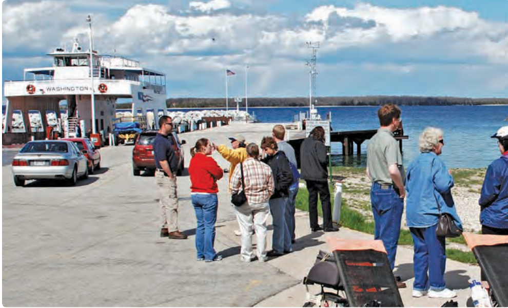
WIS 42, Door County