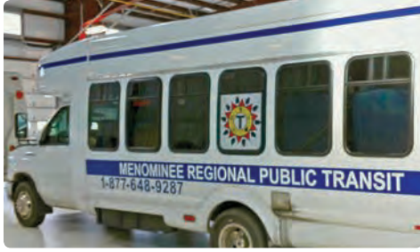
Menominee Regional Public Transit

An advantage of the tiered system is equity among all stakeholders within each tier. La Crosse, for example, gets the same share of state and federal aid as Wausau or another medium-sized urban counterpart. This level of equity limits competition among communities and regions of the state. It engenders cooperation and support for the tier