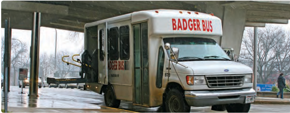
Badger Bus, Dane County

Two key population groups for whom transit is especially important are the elderly and people with disabilities. The low-income segment of this population is often limited to using transit options available through government programs in state departments of Health Services (DHS), Veterans Affairs (DVA), Workforce Development (DWD) and Transportation (the department). The department's elderly and disabled transit program supports county service providers. The DHS program combines federal and state funds to provide $60 million annually, with Medicaid as its largest funding source. 19 In total, more than $73 million was spent for specialized transportation in 2010, yet there were no assurances that everyone who wanted a ride could get one.