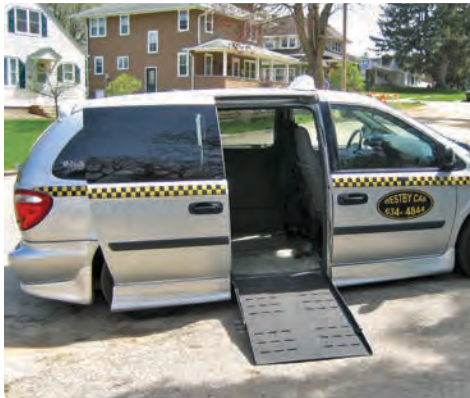
Westby Cab, Vernon County

It is the Commission’s philosophy that all modes of transportation that serve local communities should contribute a local share to the transportation program or service, including shared-ride taxi service. They support this policy for two reasons. First, a small contribution of local funds would further encourage local governments to take responsibility for the oversight of shared-ride taxi systems. Second, it would help provide an additional source of local funding.