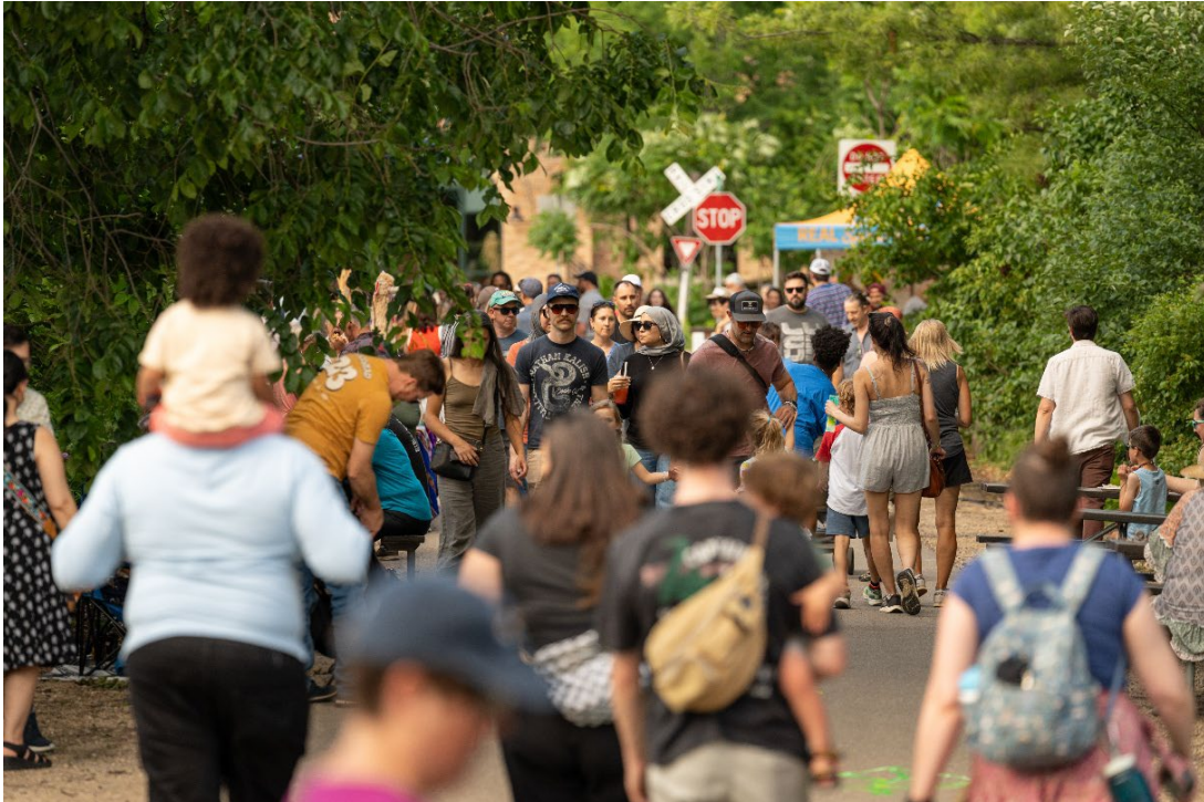
Figure 1: Sugar Ave during Summer Breeze Block Party