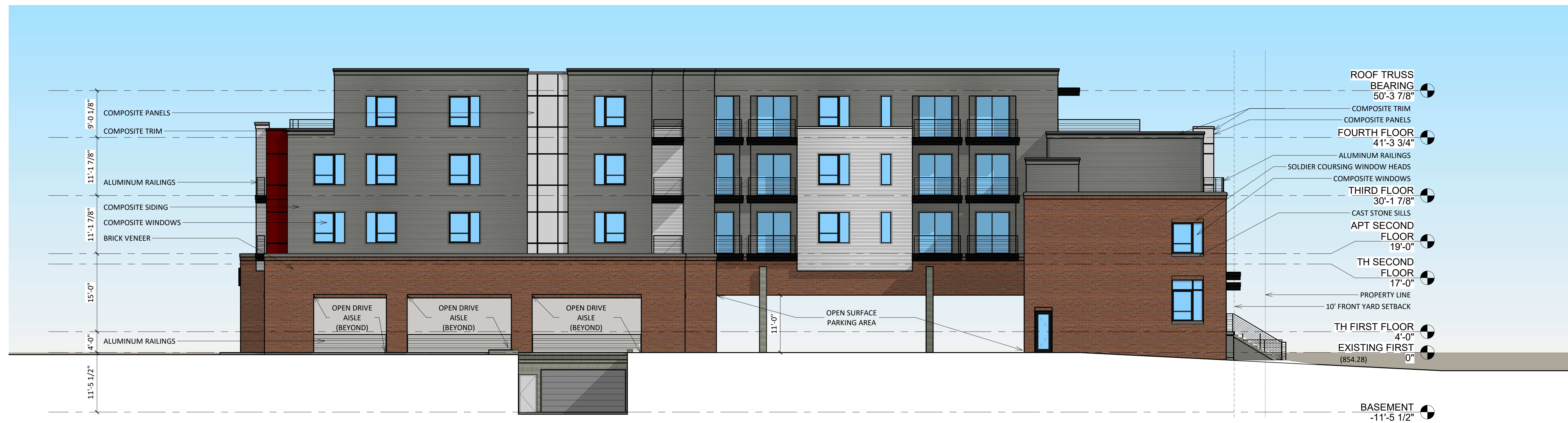
2 West - Rendered Elevation A-2.3 3/32" = 1'-0"

ISSUED Issued for Land Use Submittal - July 27, 2020