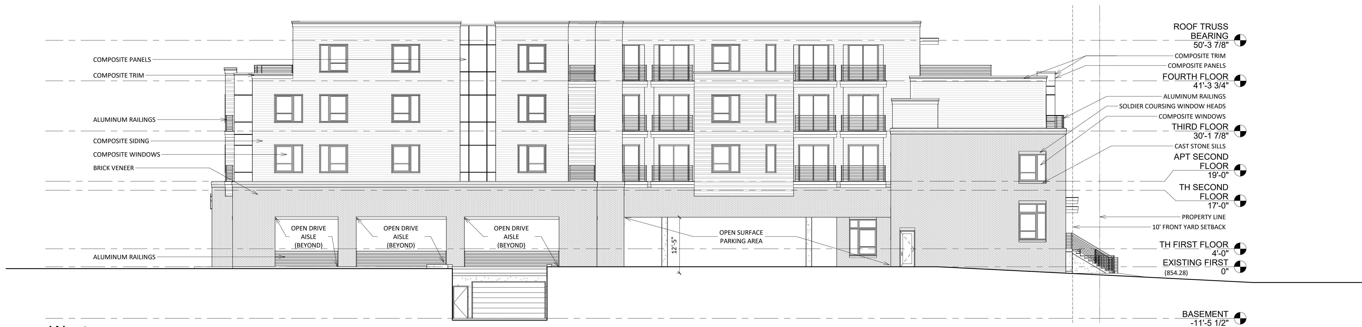
2 West A-2.1 3/32" = 1'-0"