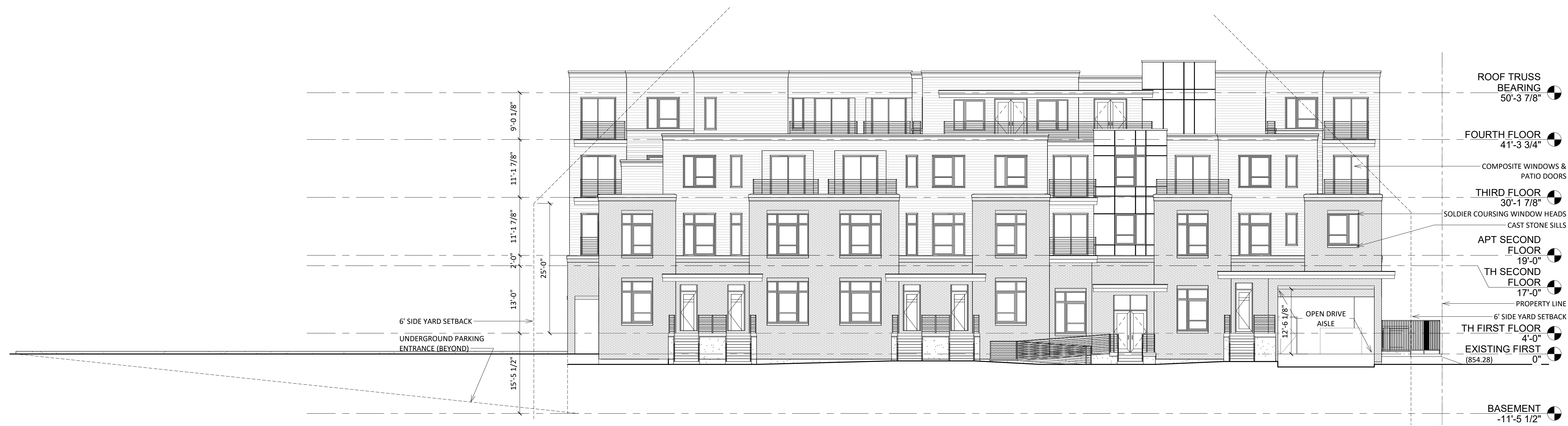
1 South A-2.2 3/32" = 1'-0"

ISSUED Issued for Land Use Submittal - July 27, 2020