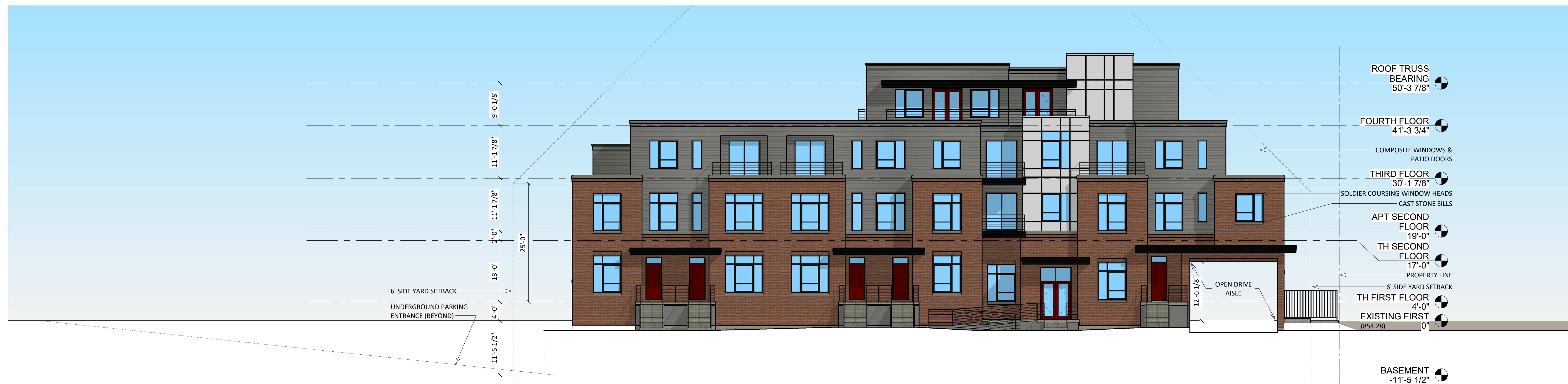
1 South - Rendered Elevation A-2.4 3/32" = 1'-0"

ISSUED Issued for Land Use Submittal - July 27, 2020