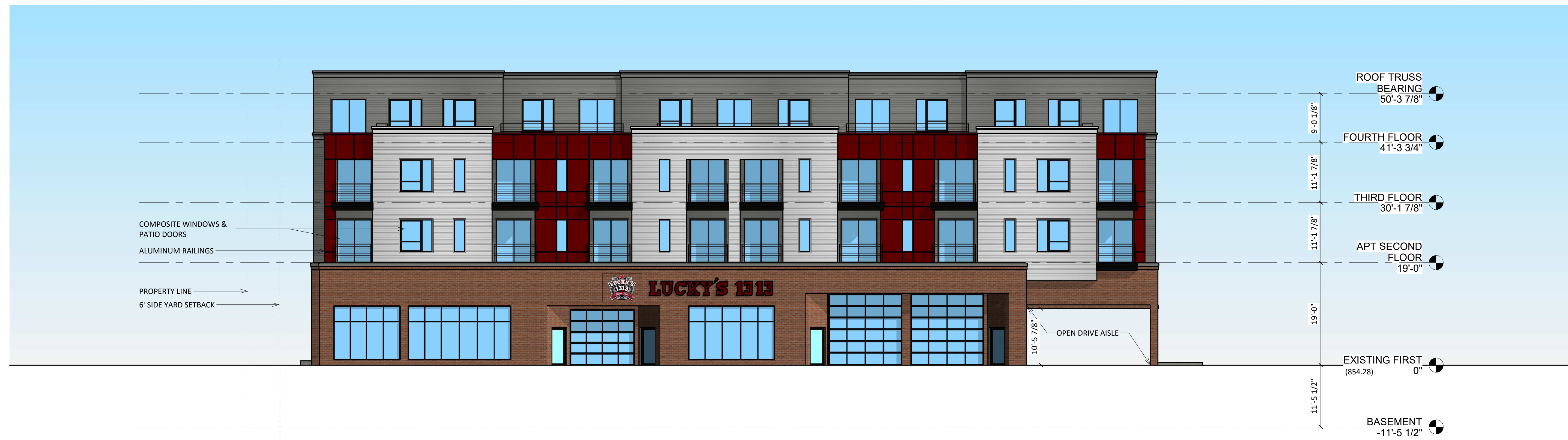
1 North - Rendered Elevation A-2.3 3/32" = 1'-0"

ISSUED Issued for Land Use Submittal - July 27, 2020