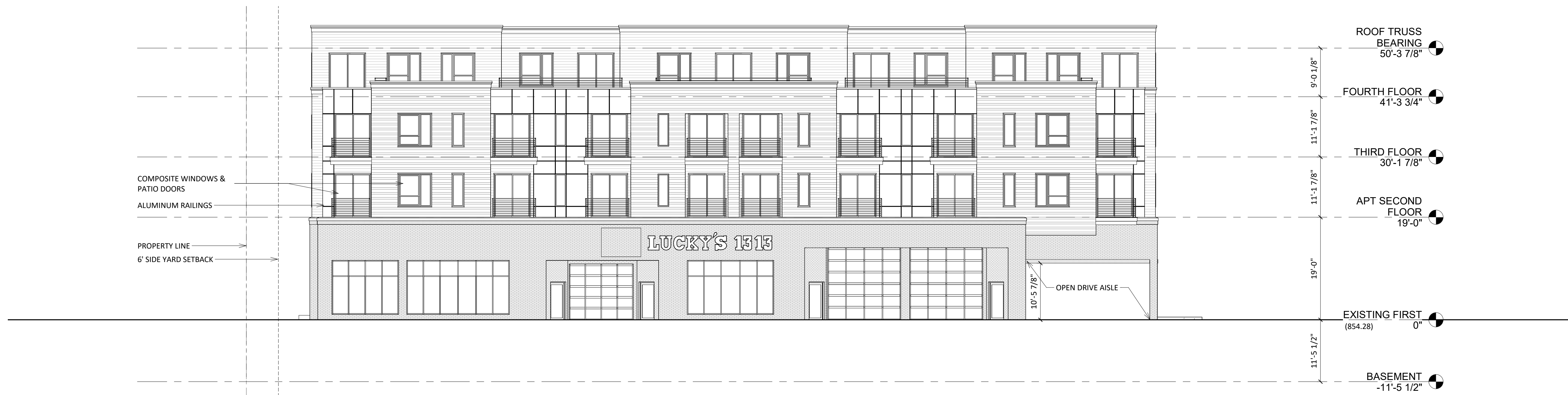
1 North A-2.1 3/32" = 1'-0"