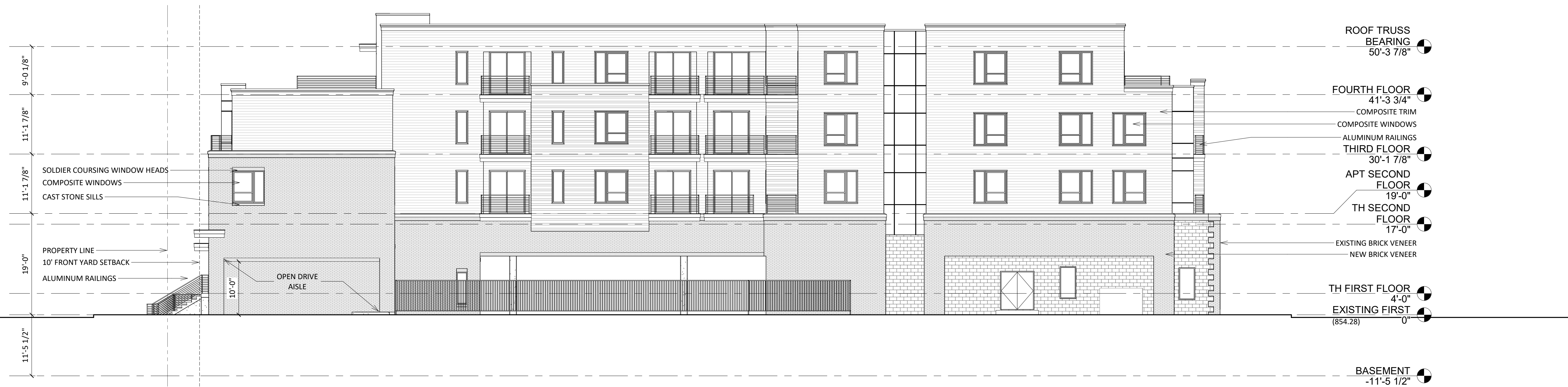
2 East A-2.2 3/32" = 1'-0"

ISSUED Issued for Land Use Submittal - July 27, 2020