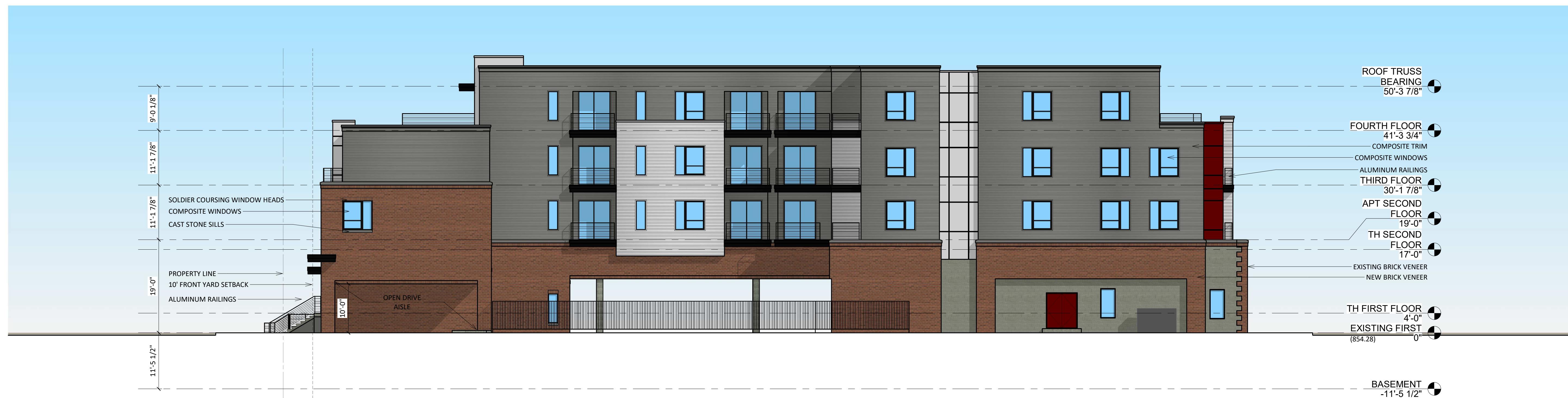
2 East - Rendered Elevation A-2.4 3/32" = 1'-0"

ISSUED Issued for Land Use Submittal - July 27, 2020