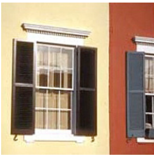
FIGURE 18.1 Delicate muntins and multi-pane sash on early 19th century row houses.

The quality of a building’s architecture and craftsmanship must be considered when evaluating the significance of a property. Buildings that exhibit distinctive characteristics of architectural design represent work by skilled craftsmen, or have high artistic value may require a greater sensitivity on the part of a responsible entity when undertaking alterations or modifications to that structure (see Figure 18.1). Worker housing in an industrial mill town was often constructed with heavy timber post and beam construction or balloon frame wooden systems, but may have very simple decorative or trim work on the interior. The significance of these properties is more closely tied to social movements within our cultural history than to architectural design. A property designed by a prominent architect using master craftsmen and artistic painters will be noted for its architectural appearance and design.