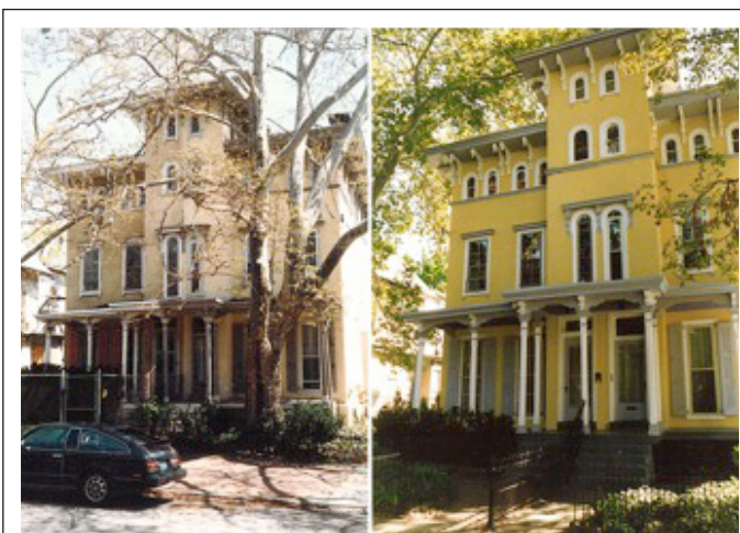
FIGURES 18.3a and 18.3b

Interim controls are generally less aggressive than abatement techniques. They include paint stabilization with correction of substrate defects, specialized cleaning, temporary repairs, management and resident education programs, and ongoing LBP maintenance. Paint stabilization, an interim control that