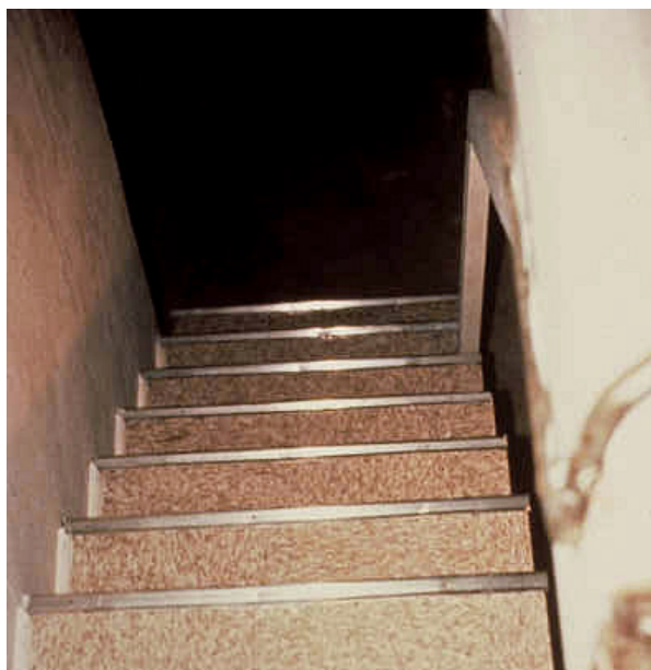
FIGURE 18.6 Enclosure of stairs in this manner is generally not appropriate in a historic property.

Encapsulating coatings, rigid encapsulant claddings, and wall enclosures affect historic resources in different ways. Depending on the overall visual effect of the resource, the long-term objectives of a preservation project, and the environmental climate of the resource, there will be differing degrees of success. For example, the use of an approved wall lining and skimcoating encapsulating system over deteriorated plaster with a finish coat of paint may be appropriate in a simple interior. However, encapsulating paint coatings over decorative moldings would not be appropriate due to the viscous nature of the coating and the loss of the decorative wood detailing. The use of encapsulant coatings on exteriors of historic wooden buildings in moist or humid areas can have damaging long-term effects. Because the thickness of exterior coatings range from 10 to 14 mil, substrates may deteriorate because of moisture trapped behind the coating.