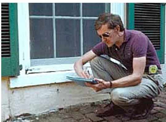
FIGURE 18.2 Historic properties should have a window condition assessment preceding work.

For each historic property, some elements will be of greater significance than others. As part of a survey of each historic property, the responsible entity should identify the elements that could be altered or removed without harming the integrity of the historic resource (e.g., plain plaster surfaces, simple board trim with no distinctive features, and non-historic intrusions, such as replacement windows). Generally, the front facades of buildings will be more significant than the less visible side and rear elevations. Public spaces on the first floor, such as the entrance area and main staircase, will generally be more significant than private spaces, such as the bedroom, kitchen, and bath. This information will be important when decisions are made about where to perform interim controls and where abatement or encapsulation is appropriate.