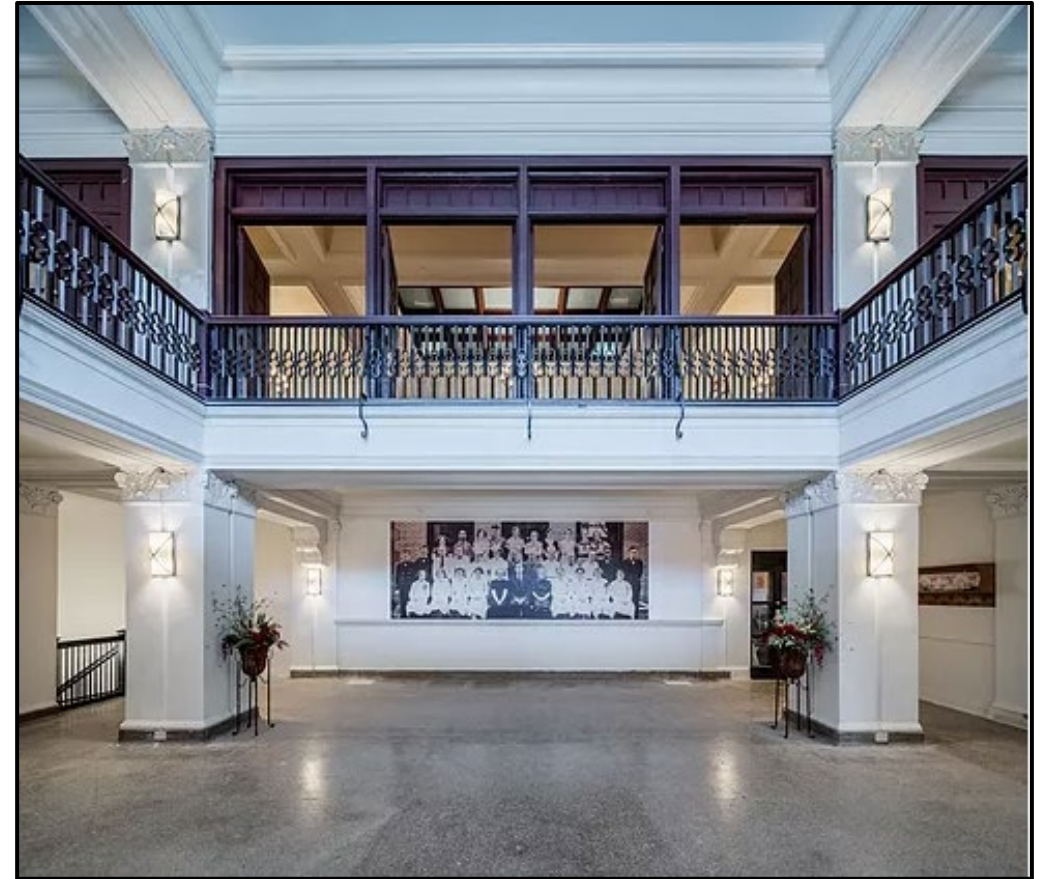
Hotel Maytag Newton, IA Hatch Development Group

Get the capital you need, when you need it