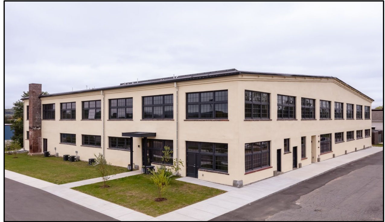
Atrium Lofts Wausau, WI MetroPlains

Customized solutions your project deserves