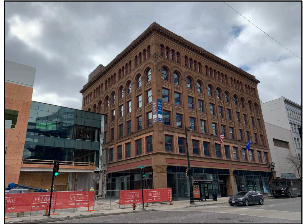
Matthews Brothers Building Milwaukee, WI Hempel