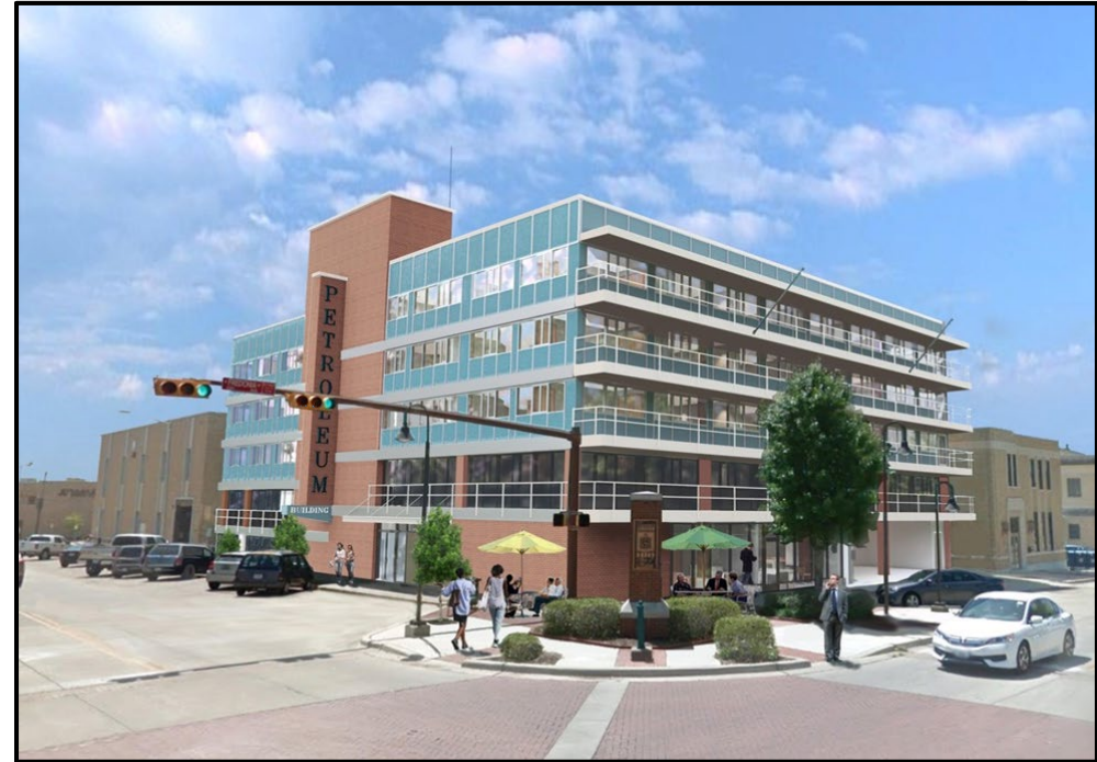
Alton Plaza, Longview, TX Saigebrook Development