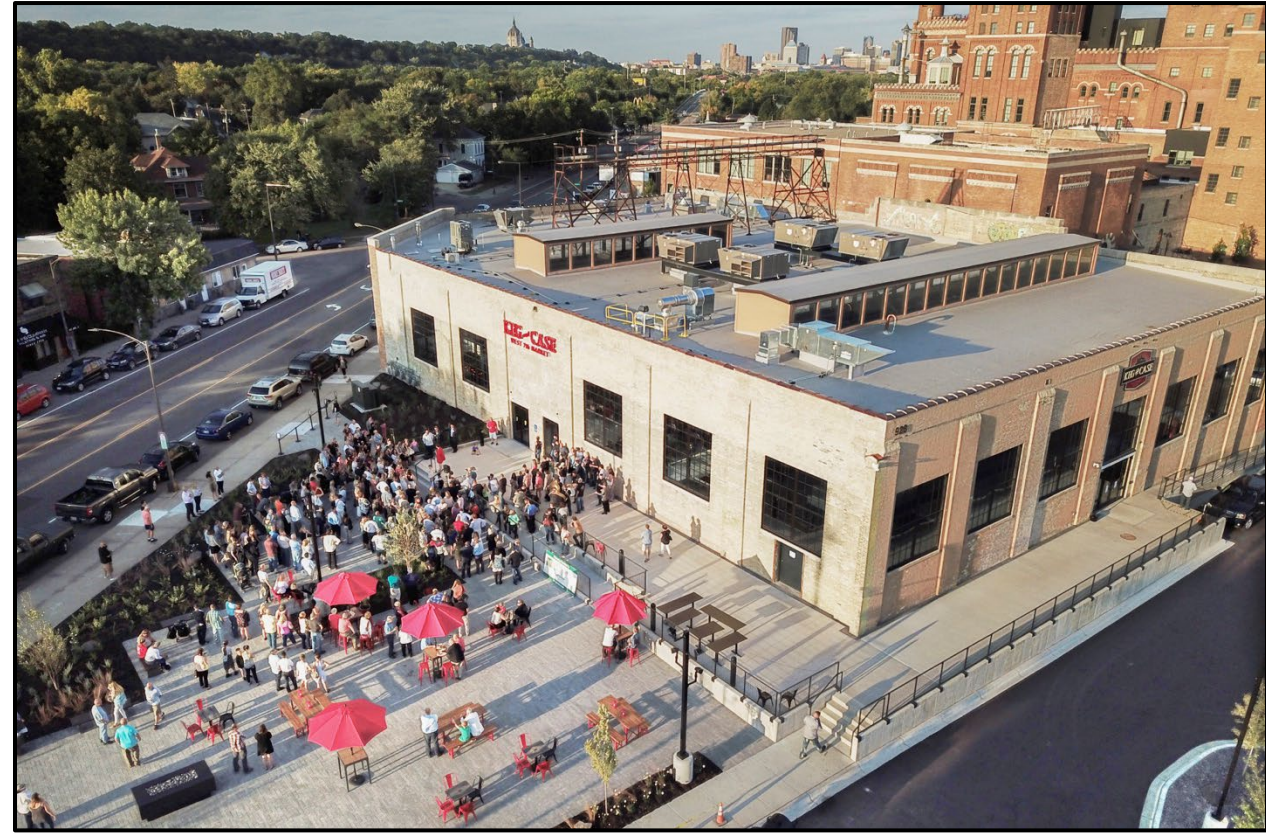
Keg & Case Market Saint Paul, MN