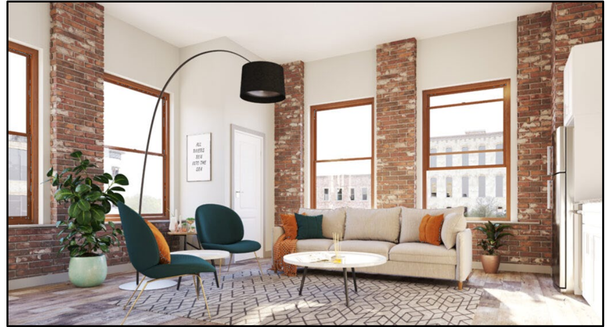
Cove Apartments Duluth, MN Roers Companies