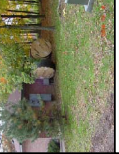
LOOKING SOUTHWEST • PROPOSED BUILDING SITE