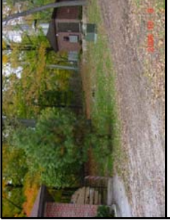
LOOKING NORTHWEST • PROPOSED BUILDING SITE