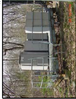
EXISTING EQUIPMENT CABINETS ON PLATFORM