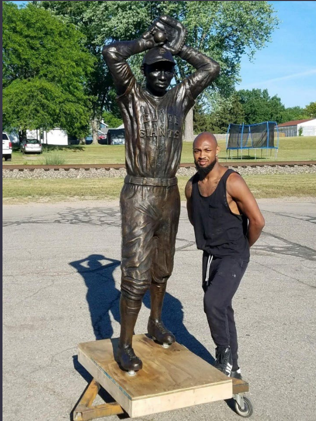
Millard Tydings Memorial Park Havre de Grace, Maryland Bronze 78 in. tall 2021