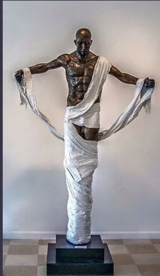
Ceramic 85 in. x 48 in. x 24 in. 2014