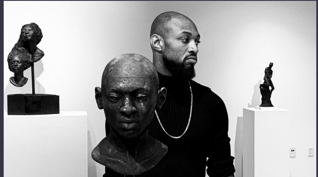
Coarse . Madison Area Technical College. Madison, WI. April 25, 2022- May 13, 2022. Photo by: Carmen Brantley for the Capitol Times. Photo used with permissions from CT.