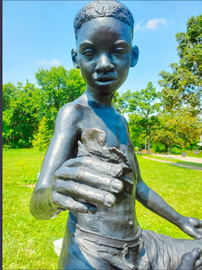
Canfield Art Park Detroit, MI Bronze 28 in. x 23 in. 16 in. 2021