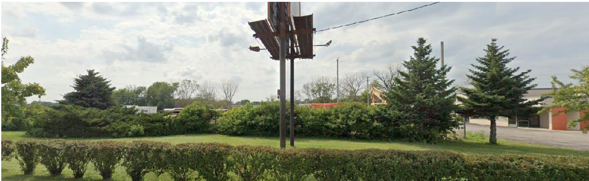
View of North end of lot from Pennsylvania Ave.