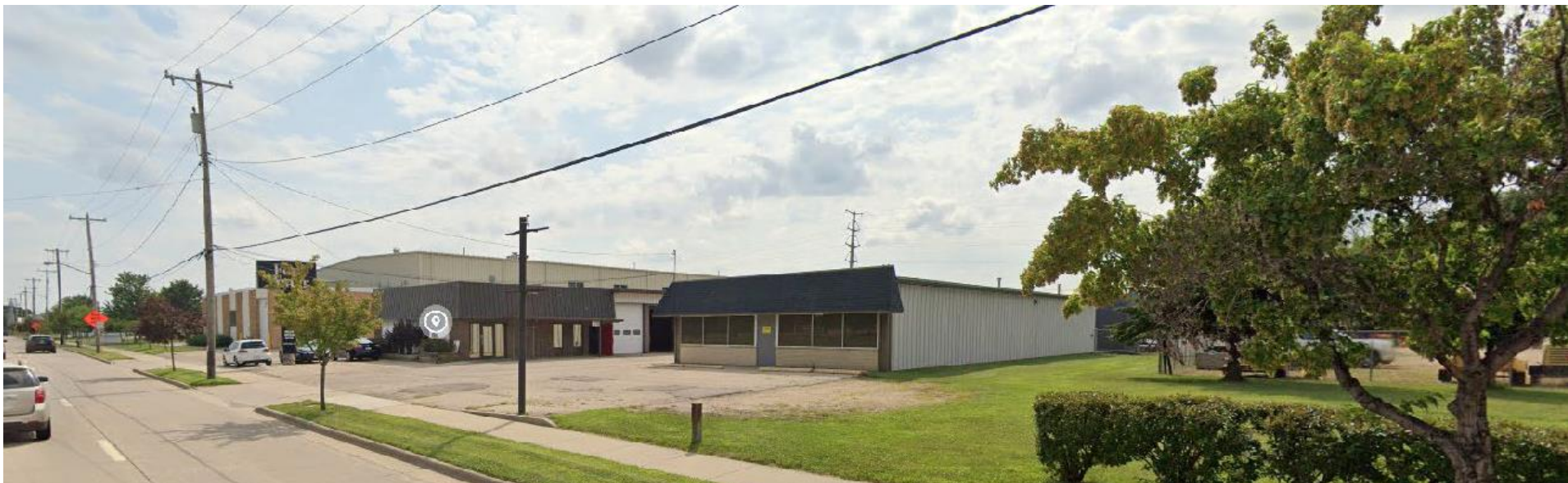
Adjacent Site to South