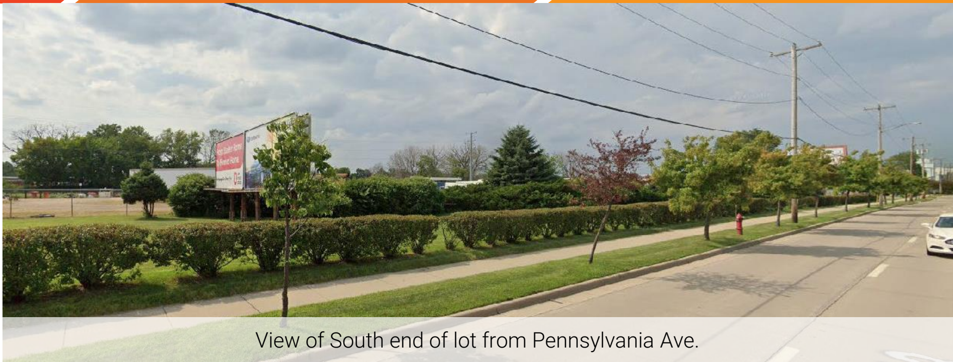
View of South end of lot from Pennsylvania Ave.