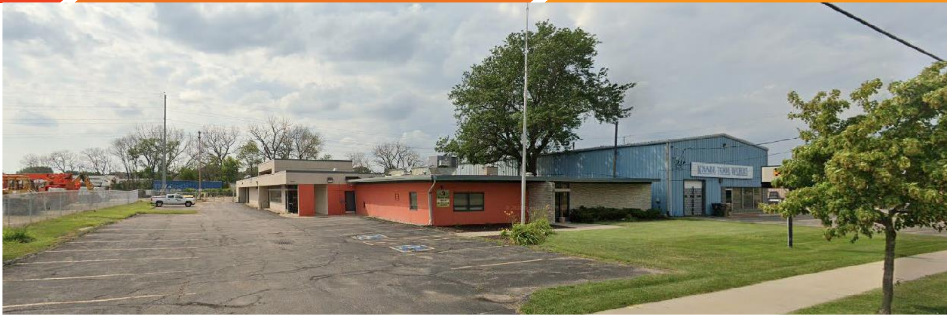
Adjacent Site to North