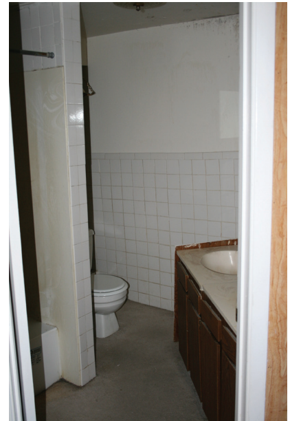
Third Floor: Bathroom