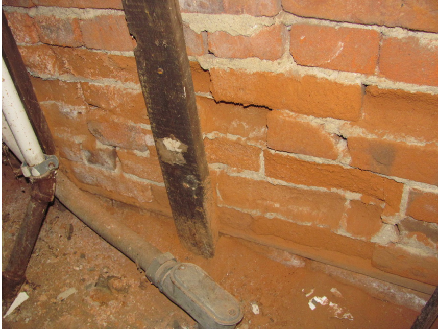
Figure 7. Deterioration of the back-up masonry at the interior of the building.