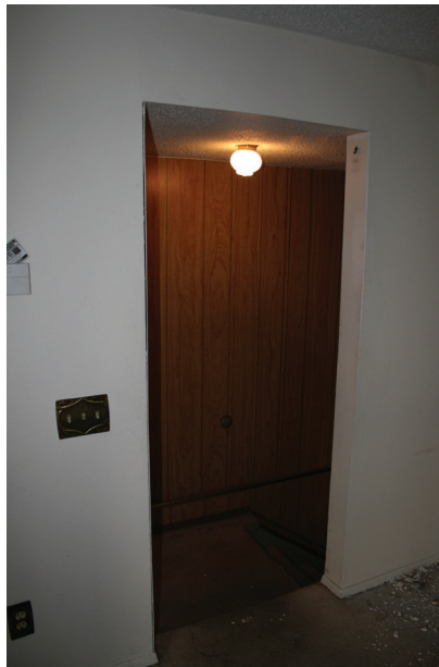
Second Floor: Entry stair from first floor showing wood paneling