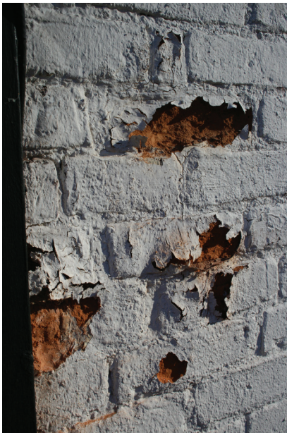
Exterior: View of damaged brick veneer