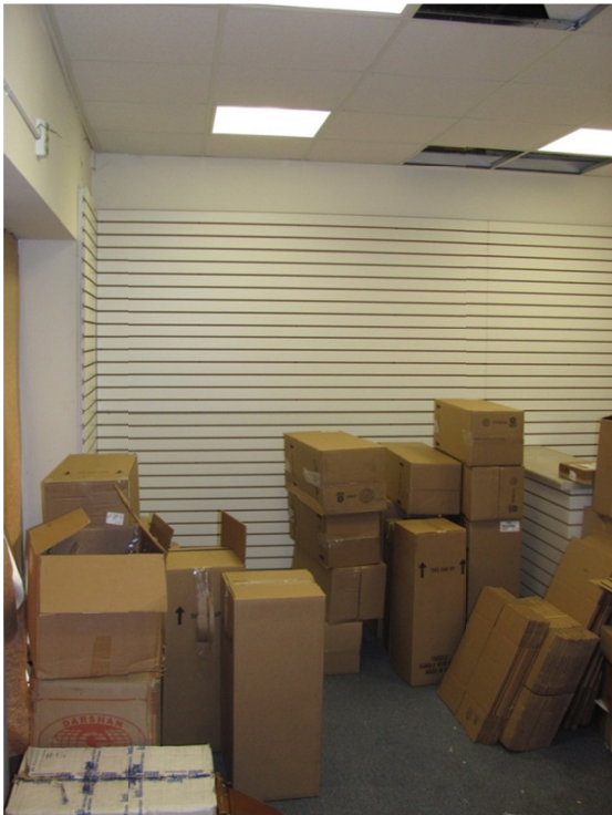
Figure 10. View of the retail interior at the first floor.