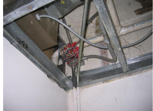
Wiring in 129 State Street.