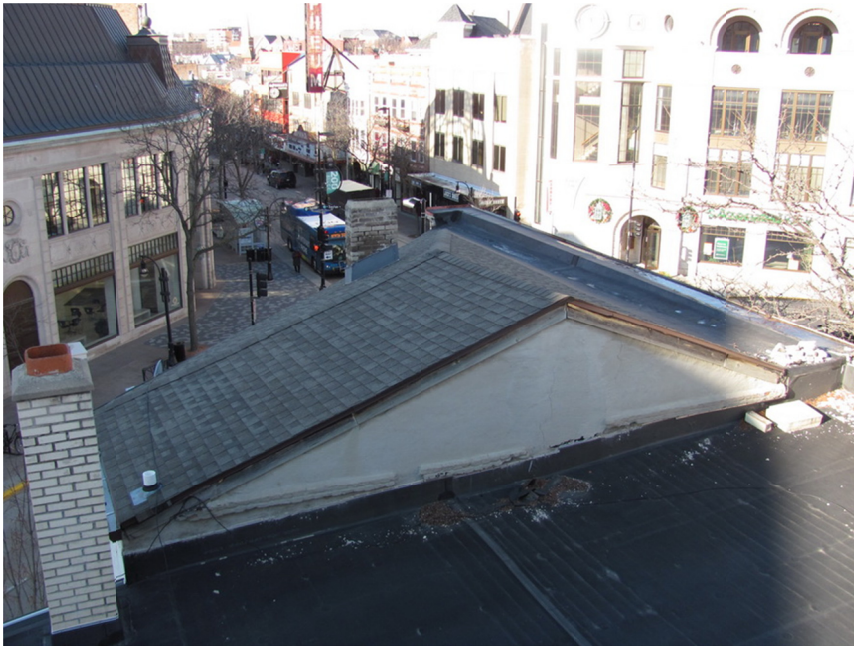
Figure 8. Overview of the roof.