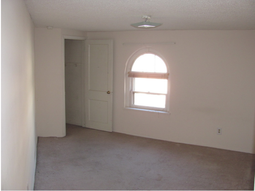
Figure 11. Typical view of the interior of the rental apartment.