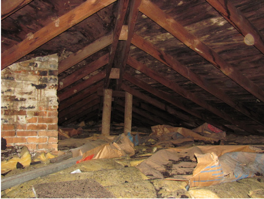
Figure 9. View of the roof framing from the attic.