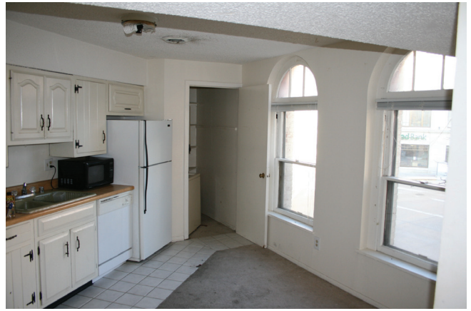
Second Floor Apartment: Kitchen