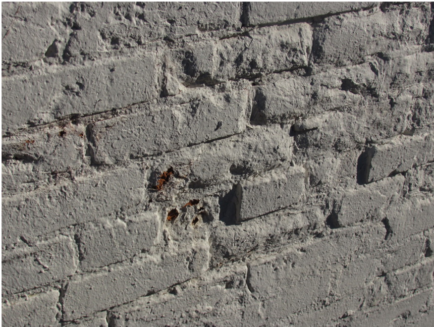
Figure 4. The coating layers were applied over unrepaired deteriorated masonry.