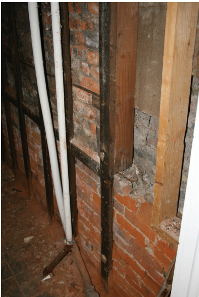
First Floor Retail