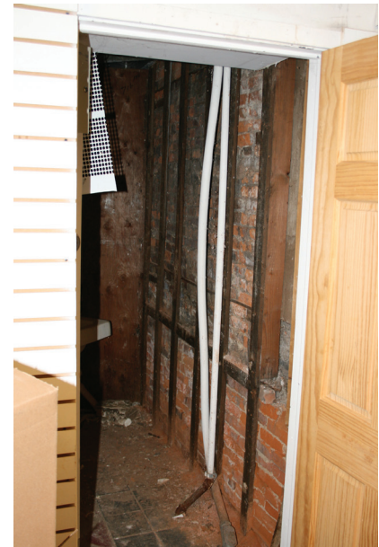
First Floor Retail