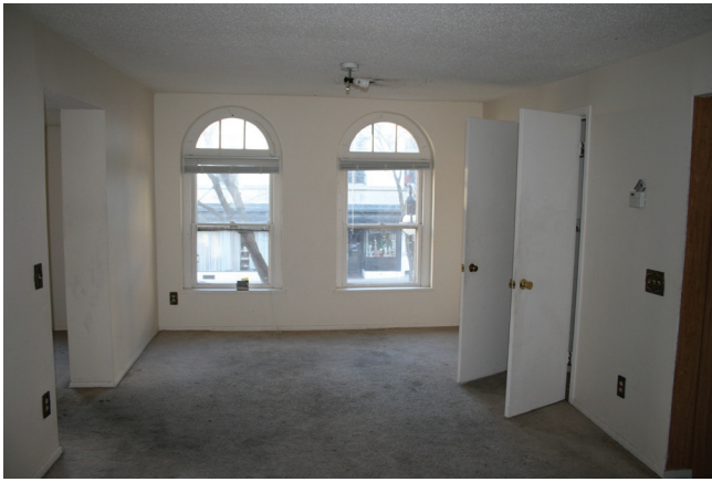
Second Floor Apartment: Living Room