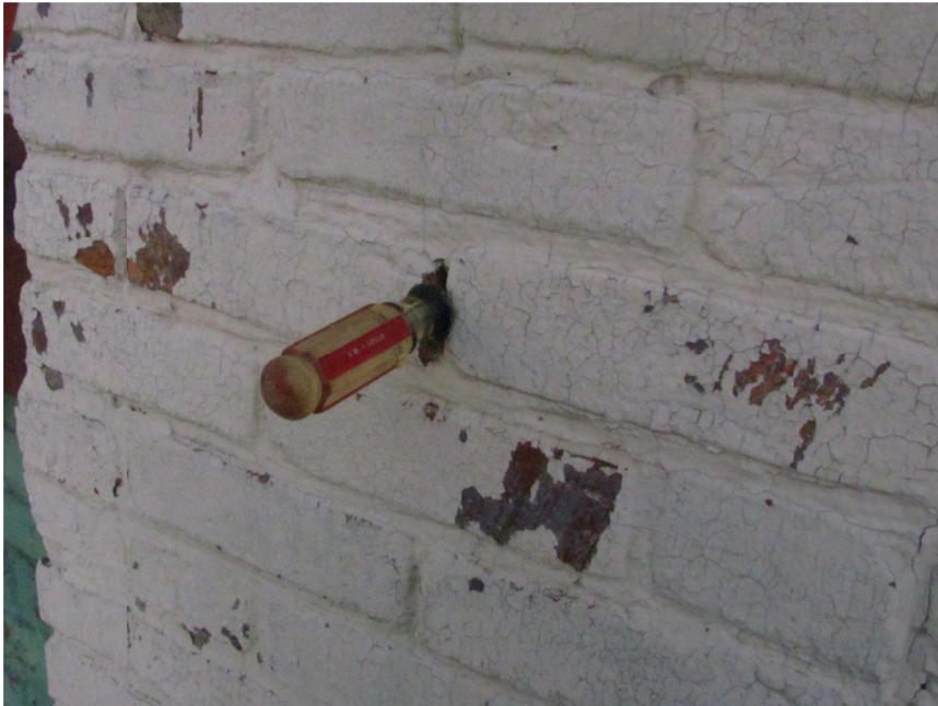
Figure 6. Mortar behind the coating layers has disintegrated, resulting in voids within the masonry construction.