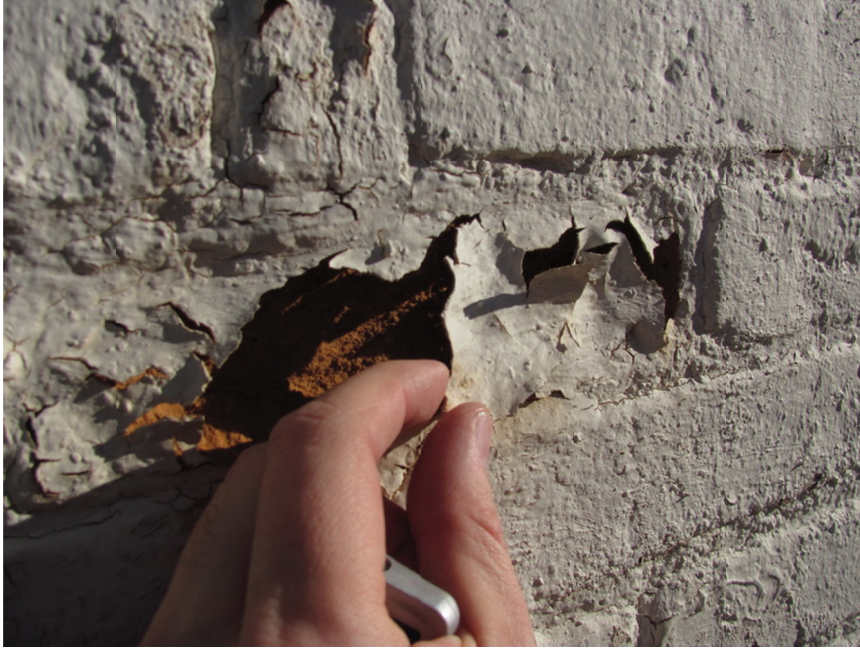
Figure 3. Loss of the coating reveals severely deteriorated brick units.