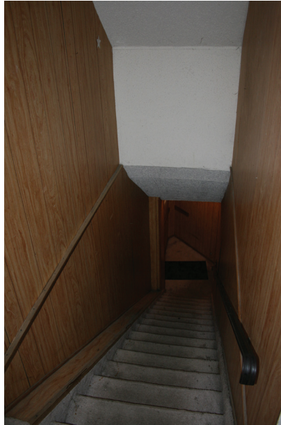
View of entrance stair access from north Fairchild Street