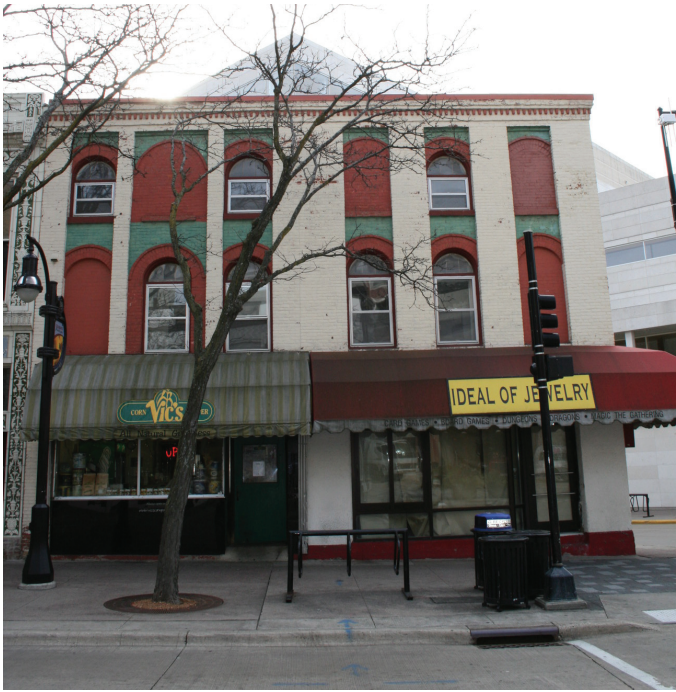
View of Front Facade