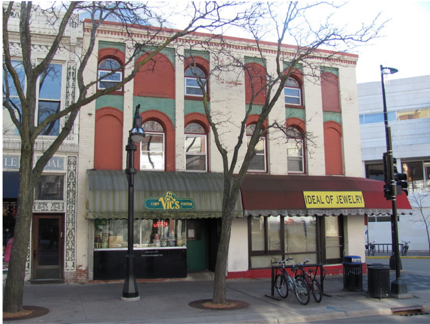
Figure 1. Overall view of the State Street facade.