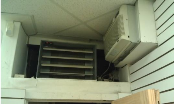
Corner retail heating and cooling