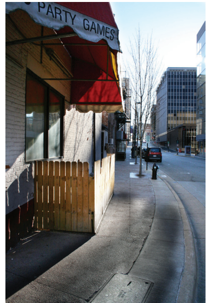
Exterior: View of basement stair access within the public right-of-way