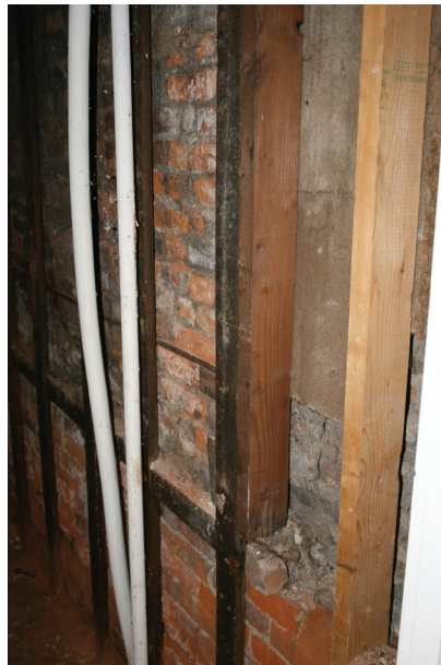
First Floor Retail