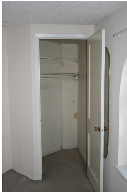
Third Floor: View of bedroom closet at Flat-Iron building corner