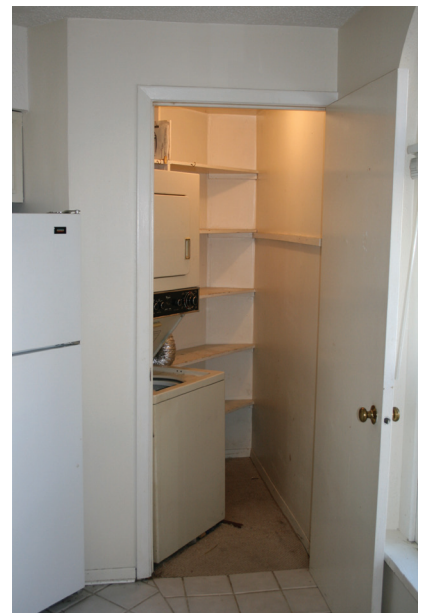
Second Floor: View of laundry at Flat-Iron building corner