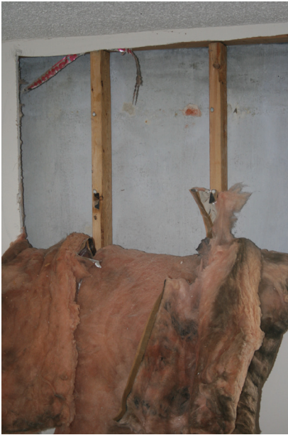
Third Floor: Section of exterior wall exposed showing back of brick and moisture within the insulation space