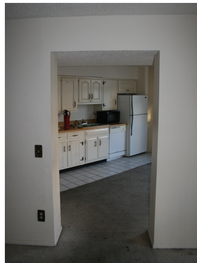
Second Floor: Structural bearing wall between living room and kitchen