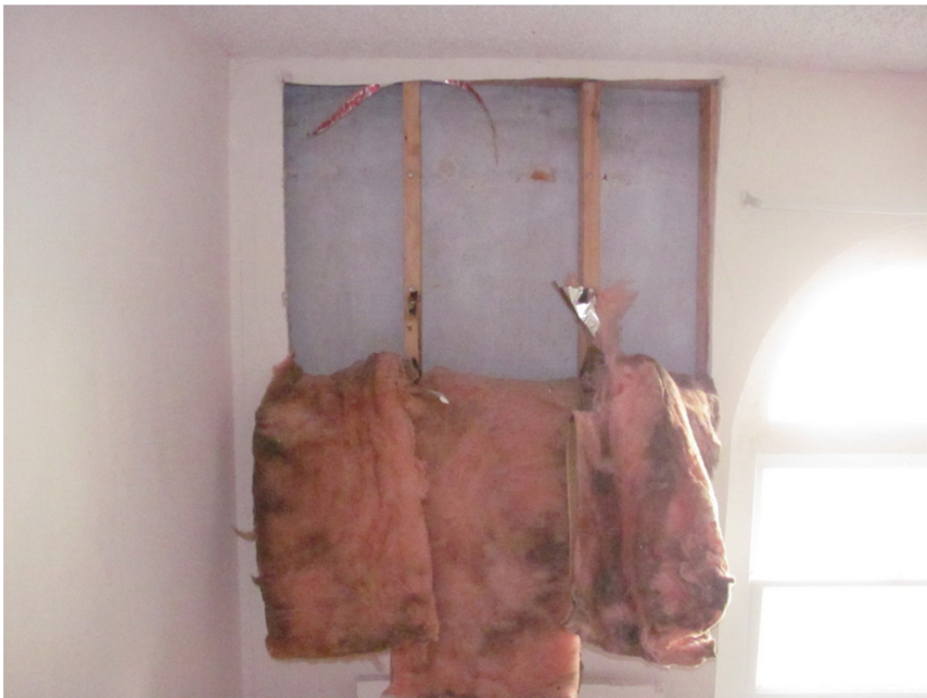
Figure 12. Staining and evidence of moisture penetration was observed on the batt insulation and plaster at an inspection opening created at the third floor during the site visit.