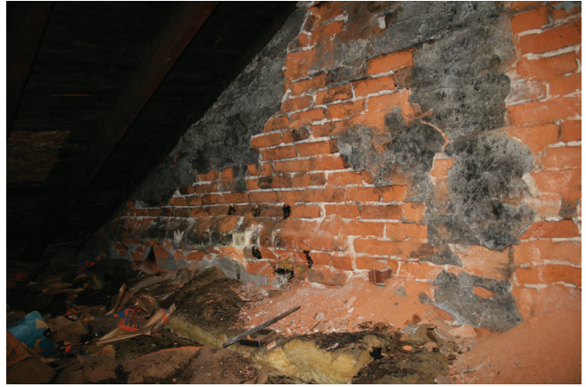
Attic: View toward wall between 127-129 state street and the castle and doyle building showing significant damage to existing brick