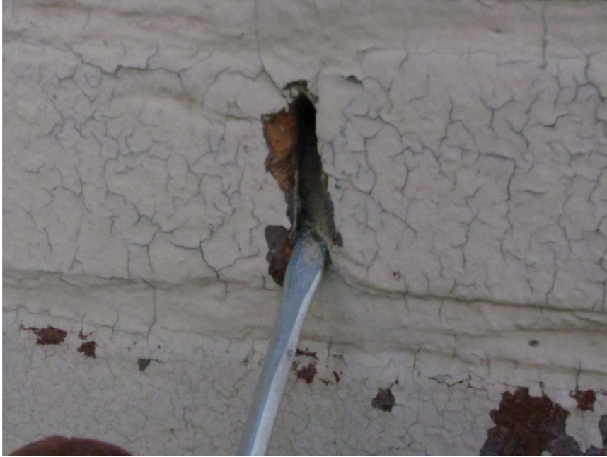
Figure 5. Mortar behind the coating layers is friable and has disintegrated.