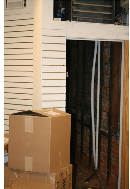
First Floor Retail