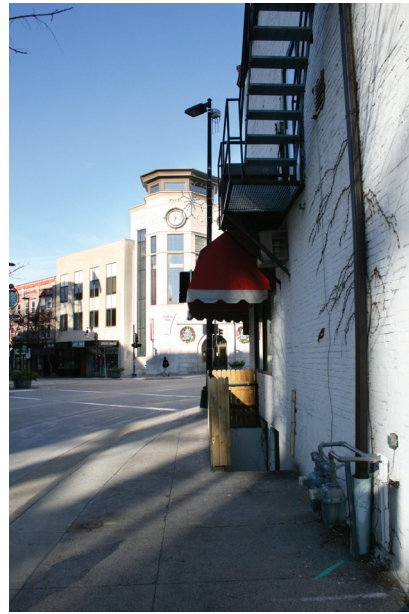
Exterior: View of basement access, gas meter and fire escape within the public right-of-way