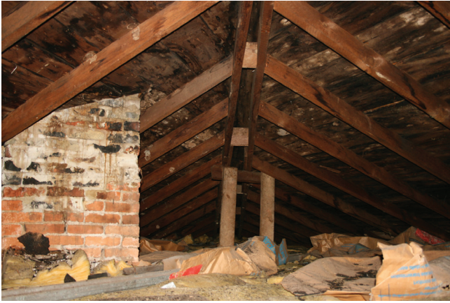
Attic: View toward flat iron corner showing damage to chimney