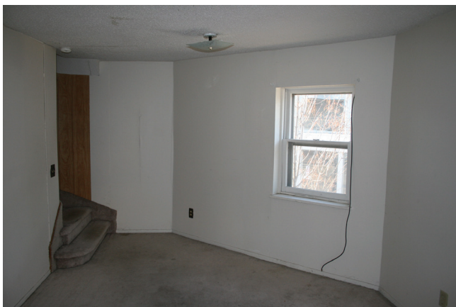
Second Floor Apartment: Living Room