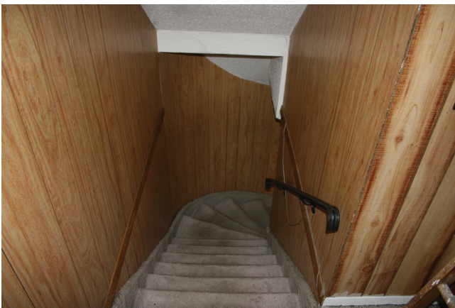
Third floor: View down stairs toward the second floor