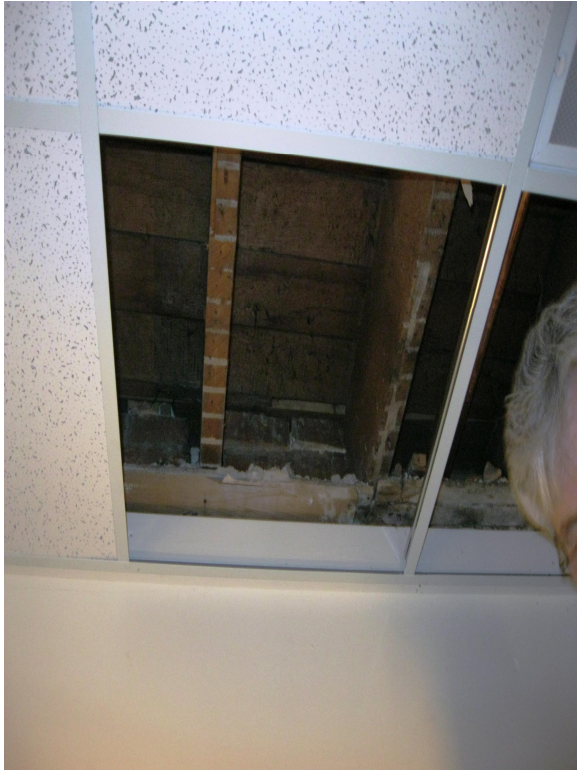
Photo 12 – 2 nd floor joist framing observed from 1 st floor retail space