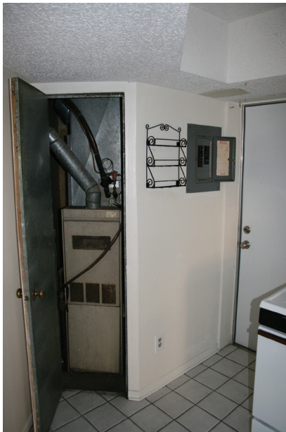
Second Floor: Mechanical and door to fire escape