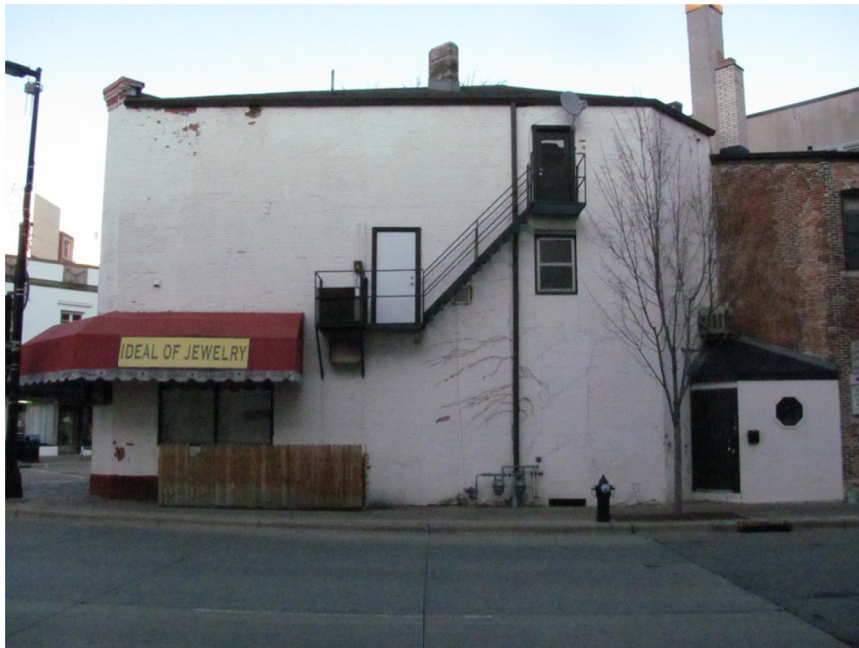
Figure 2. Overall view of the Fairchild Street facade.