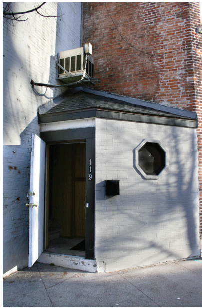
Exterior: Entry to apartment on N Fairchild Street