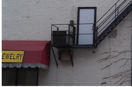
Apartment condensing unit