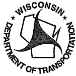
EXHIBIT A (page 1 of 3)

Division of Transportation Investment Management Bureau of Transit, Local Roads, Railroads & Harbors PO Box 7914 Madison, WI 53707-7914