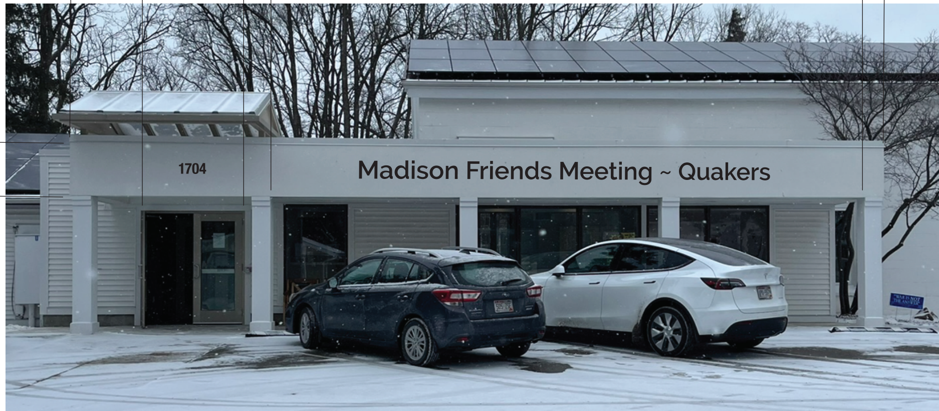
PROPOSED SIGN ***MAY NOY BE TO EXACT SCALE***