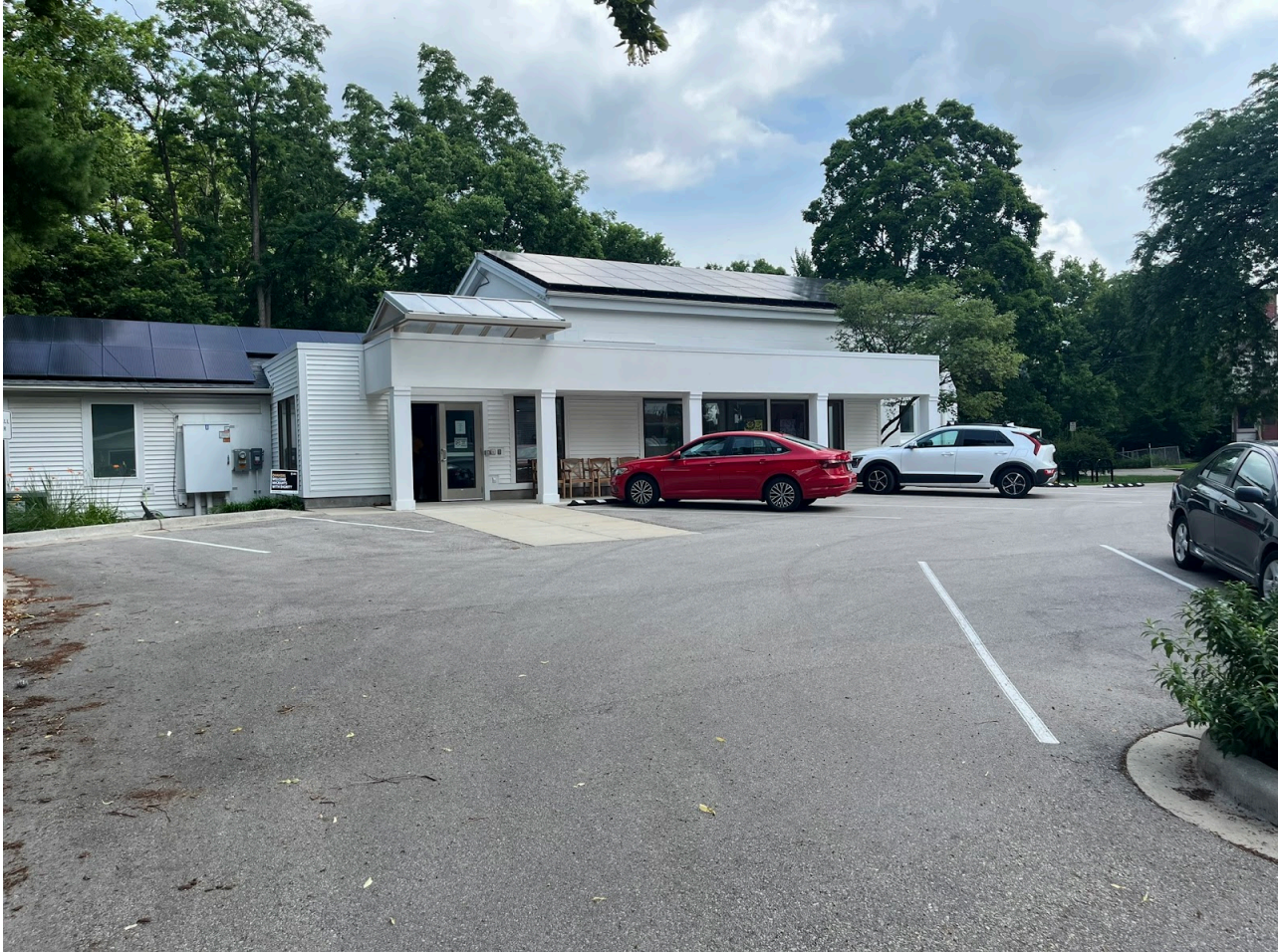
View coming from Spooner St. onto Roberts Court