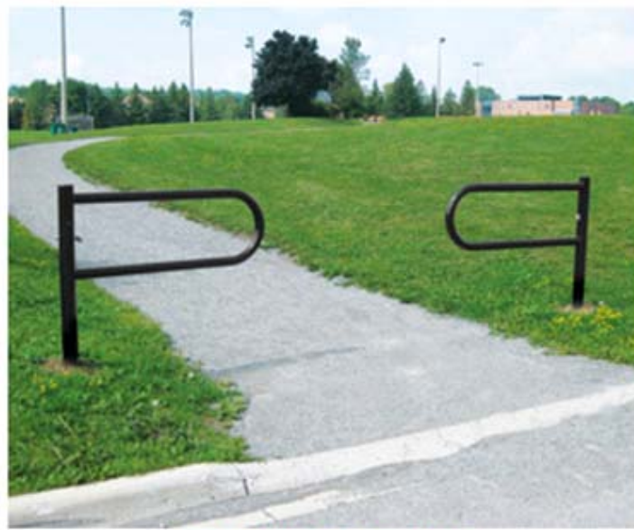
Model B35-GATE-42X55 (Two Bollards Shown)