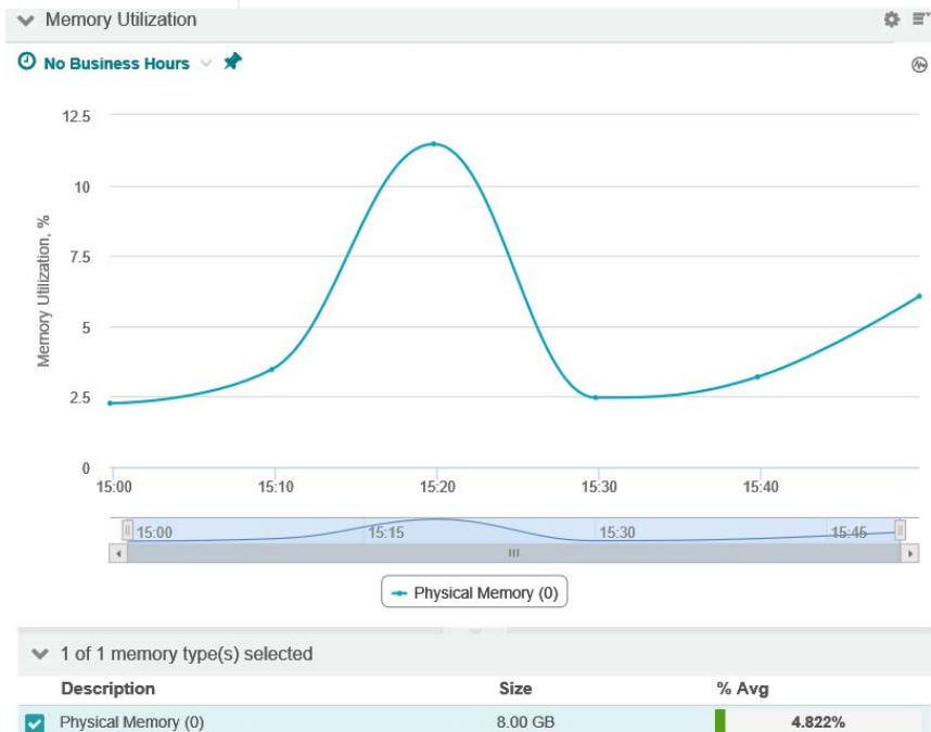
Potential malware activity