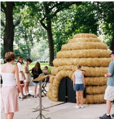
"The Beehive Project" by Chele Isaac, was an interactive public art project consisting of a large scale beehive, featuring a queen bee inside typing a story on an old typewriter. The public participated by helping to write the story.