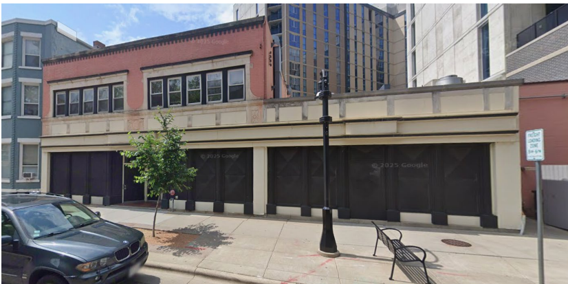
Google Streetview of Gilman storefront