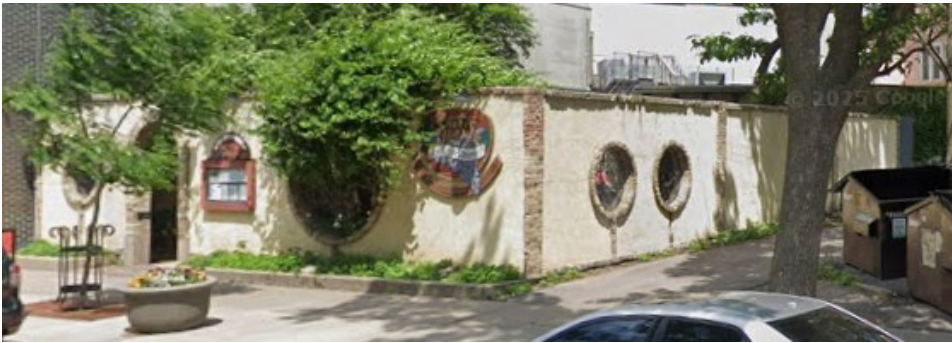
Google Streetview of Frances storefront