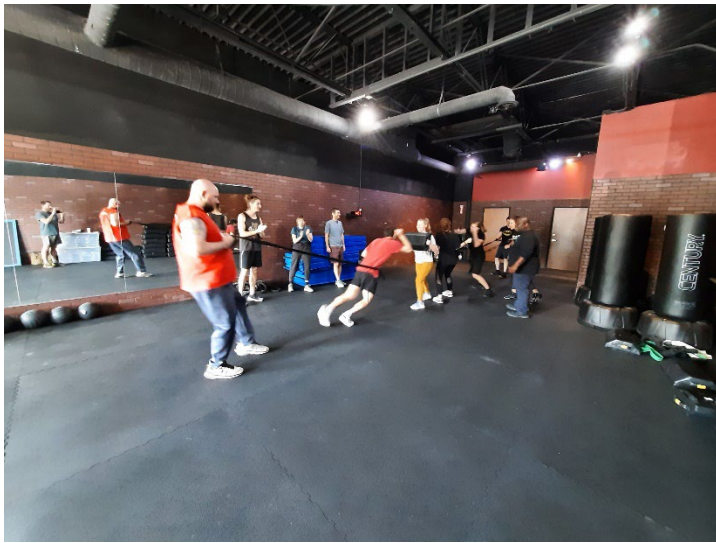
Krav Maga self-defense