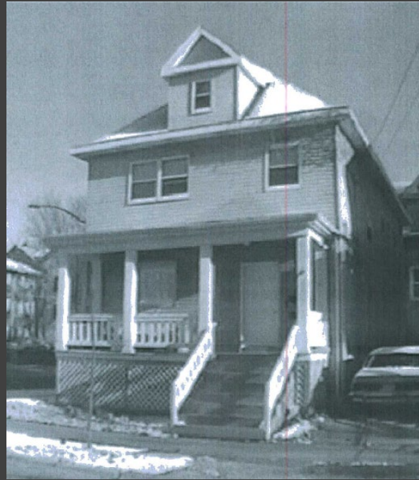
City Preservation File - 1973