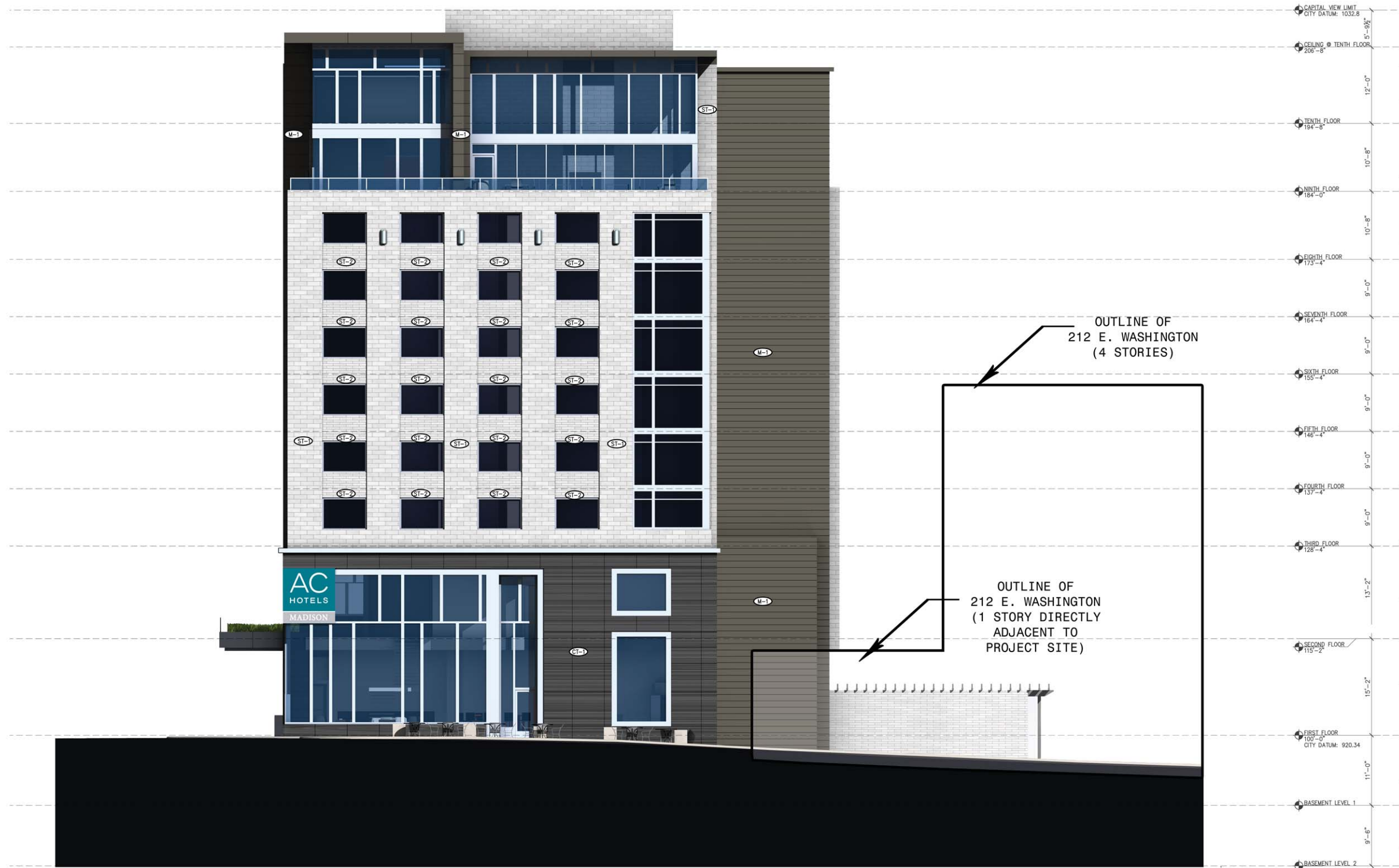
EAST ELEVATION SCALE: 1/8" = 1'-0"

PROJECT: AC BY MARRIOTT - DOWNTOWN MADISON 202 E. WASHINGTON AVE. MADISON, WISCONSIN OWNER: 202 E. WASHINGTON LLC C/O: NORTH CENTRAL GROUP 1600 ASPEN COMMONS, SUITE 200 - MIDDLETON, WISCONSIN