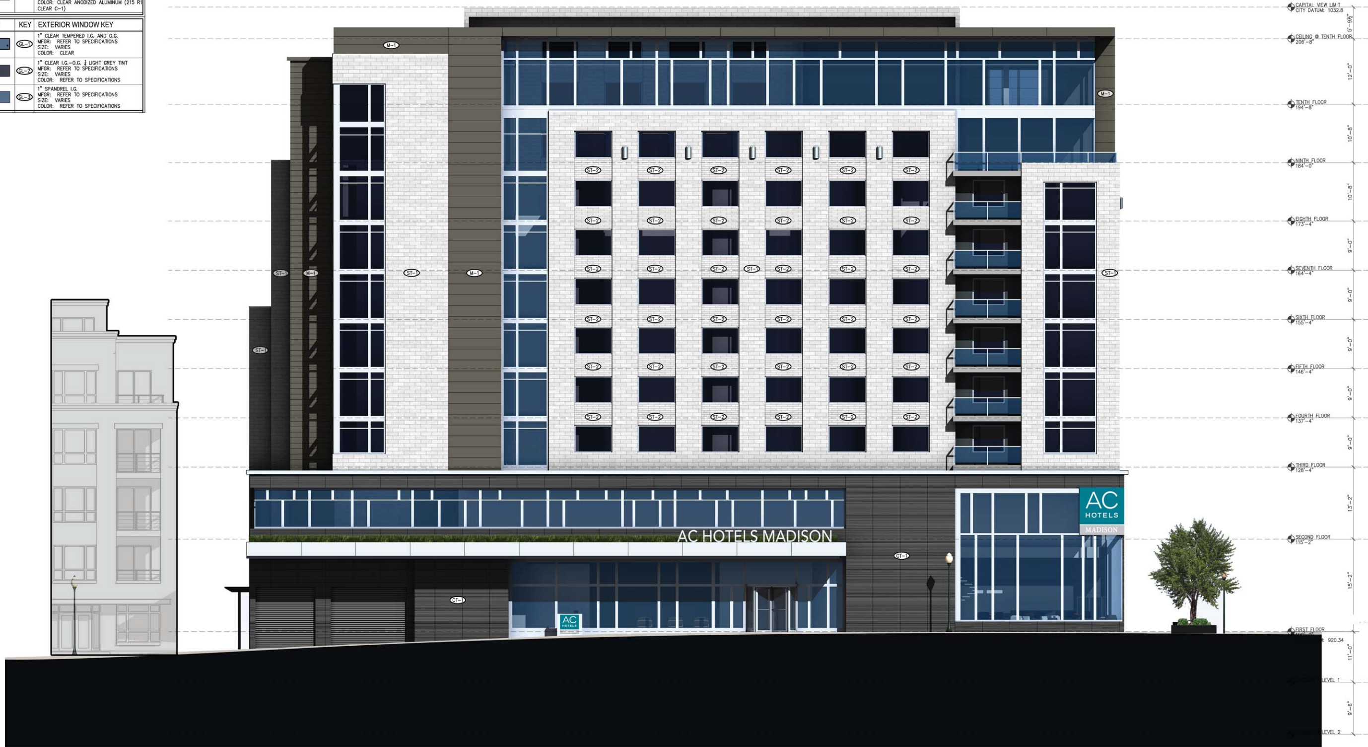
SOUTH ELEVATION SCALE: 1/8" = 1'-0"