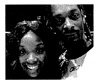
Stars You Didn't Know Were Related