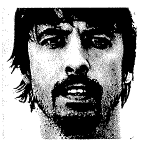
17 Cover Songs That Completely Blow Away The Original