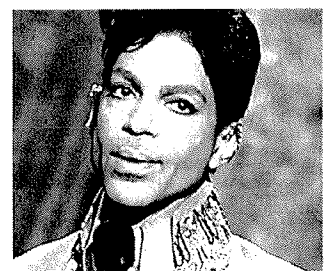
Autopsy Reveals Prince's True Cause Of Death