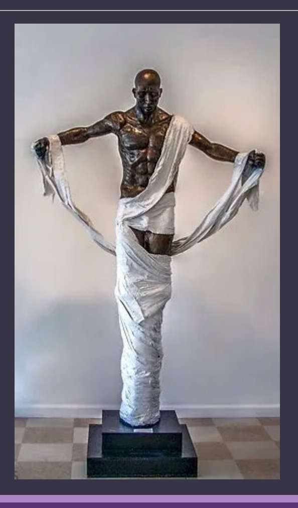
Ceramic 85 in. x 48 in. x 24 in. 2014