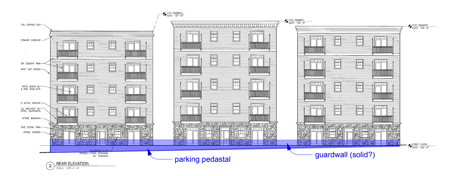
Illustration of building pedastal created by parking structure below first floor, not shown in submissions.

These drawings are generated from the outline of the parking structure combined with topographical data shown in plan views.