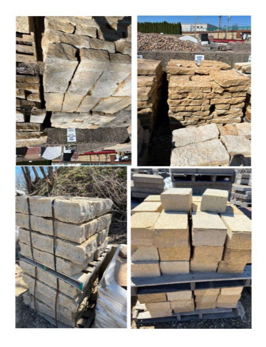
Similar Wall 805 Williamson Street