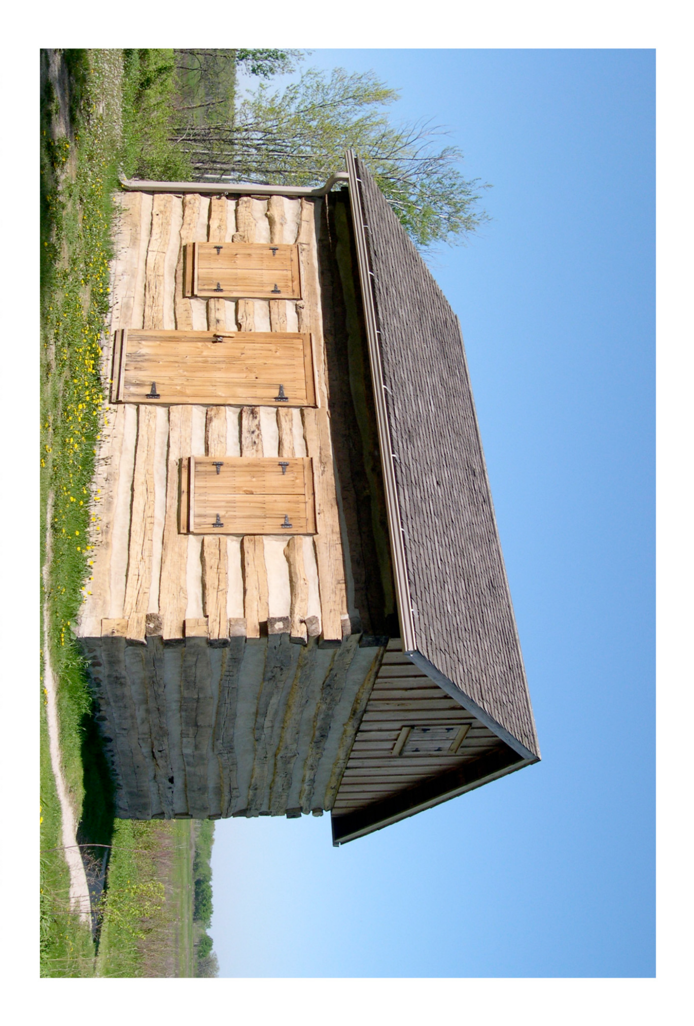
Photo of the recently restored Gotten Cabin ~ very similar to Madison Children's Museum's historic 1838 log cabin