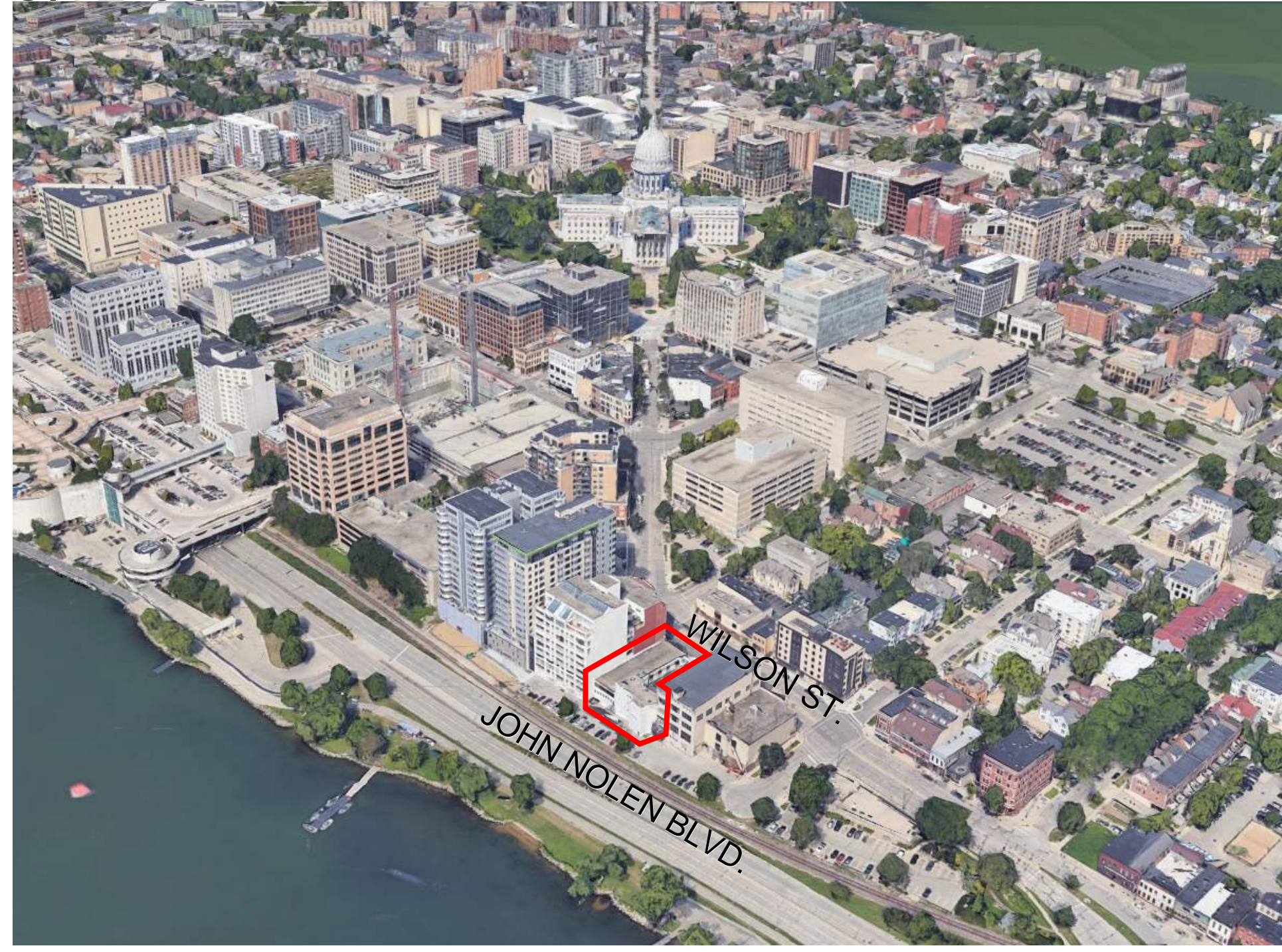
AERIAL IMAGE OF DOWNTOWN MADISON LOOKING WEST