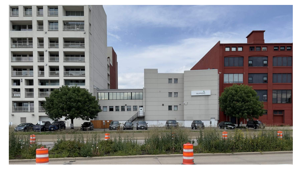
EXISTING JOHN NOLEN BLVD. FACADE