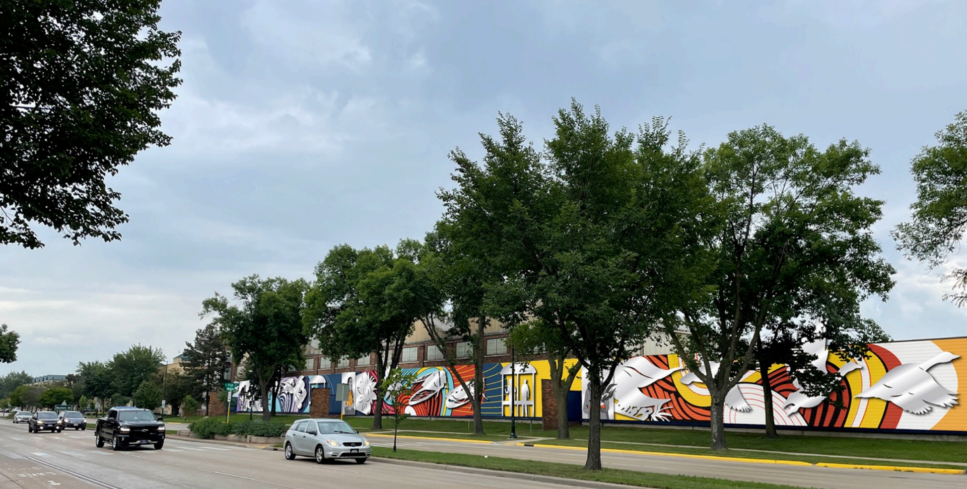
“The buses feel like going home.” – Nada