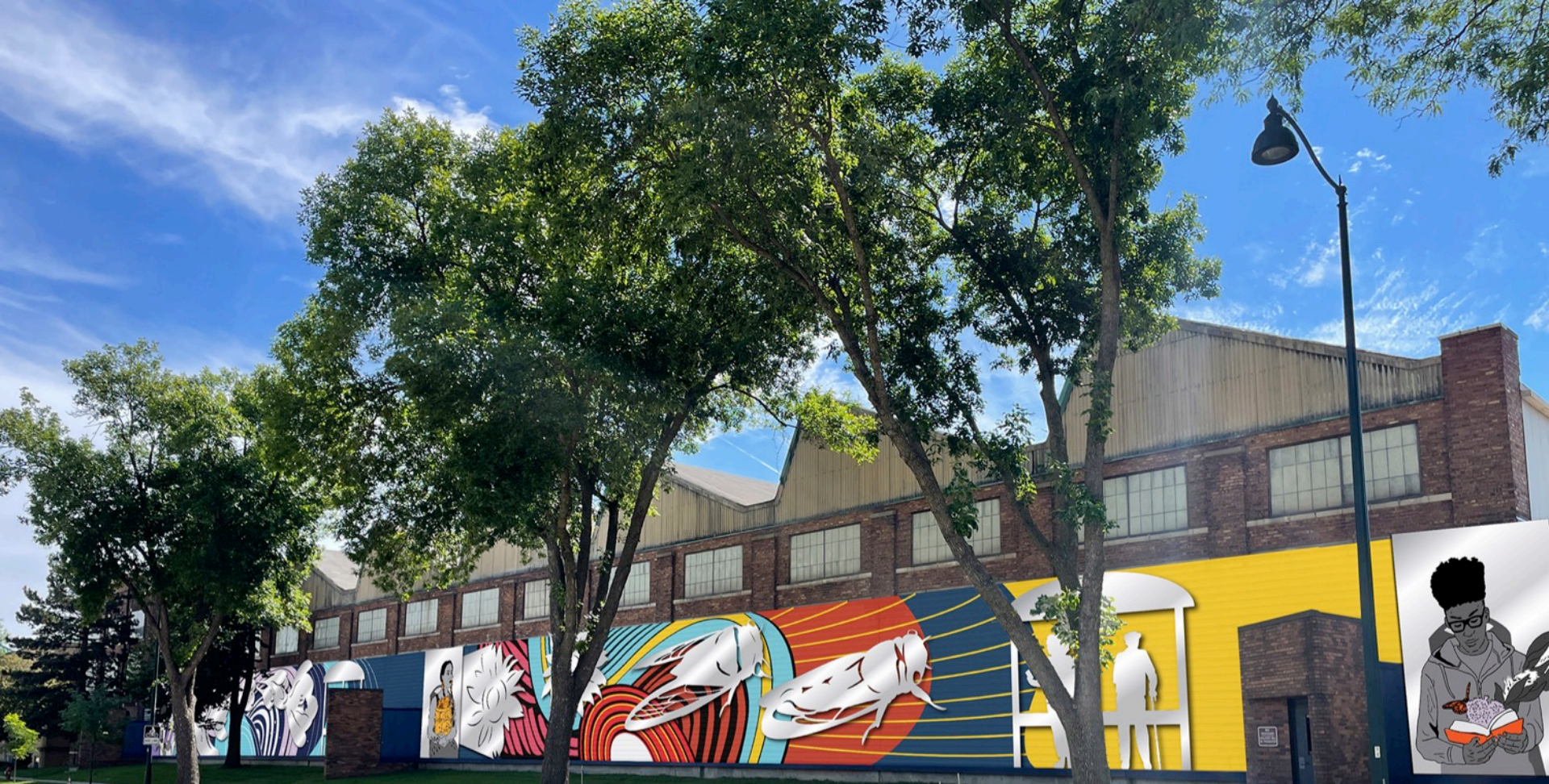
“A lifeline because I don’t drive.” – Angélica