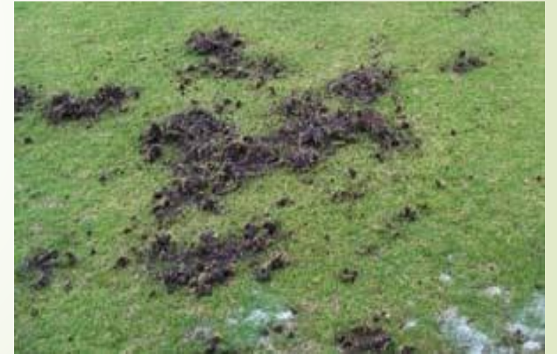
Direct observation of course indicated animals feeding on grubs