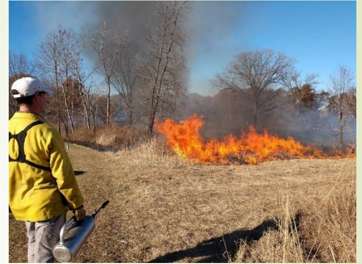
Staff conducting prescribed burn at Cherokee Conservation Park