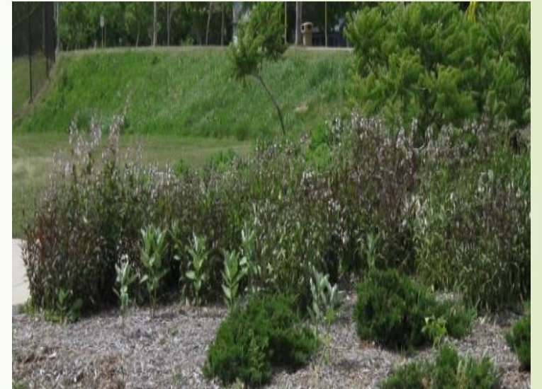
Goodman Pool planting bed serves as a waystation for Monarchs.