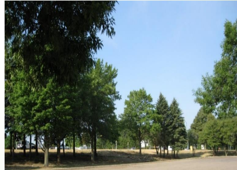
Garner Park 2012 after extensive beautification work.