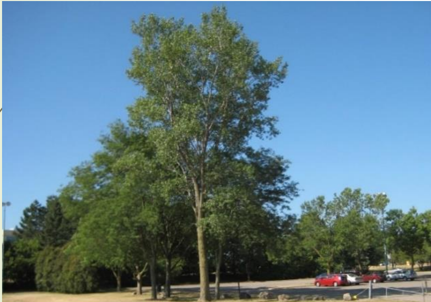
Garner Park 2012: No Mow areas