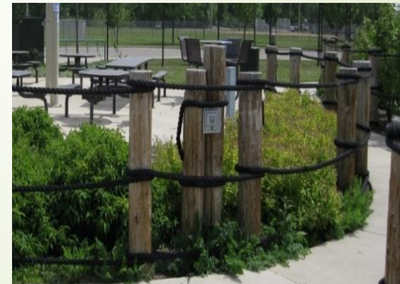
Goodman Pool thistle