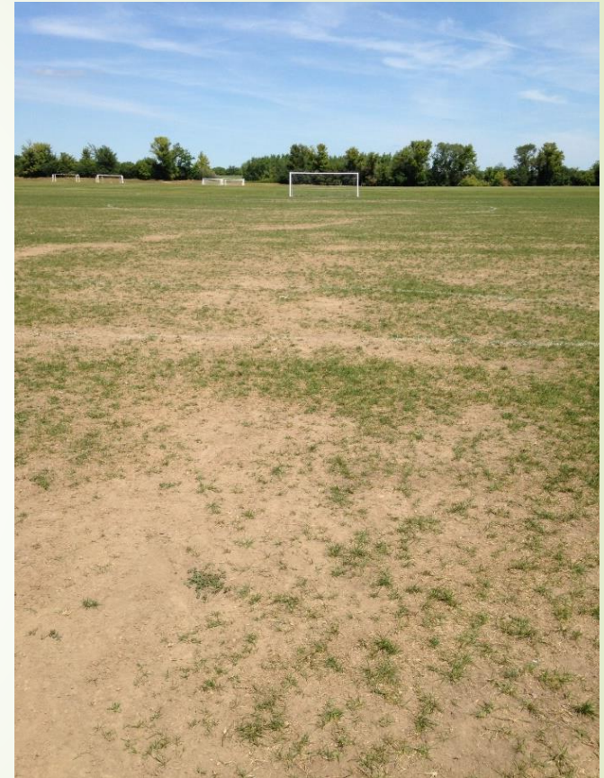
Reindahl Park -- 2014 damage as a result of over-use and compacted soils. Very thin turf that is not safe for play.