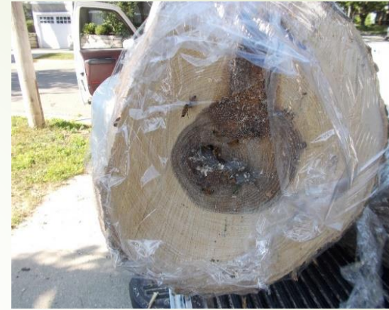
This log contains a hive from a street tree that was carefully removed and wrapped to protect the honeybees.