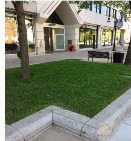
Turf following extensive repairs