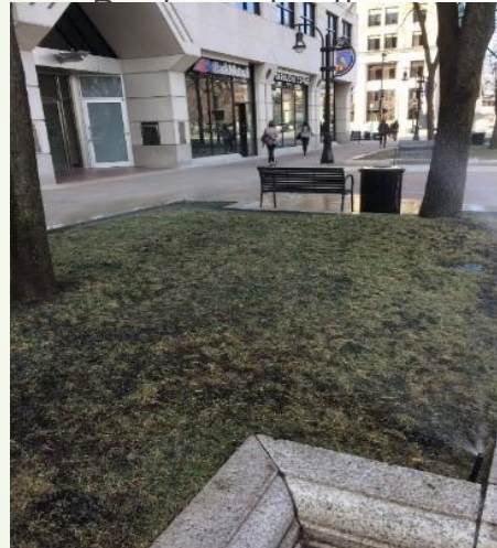
Severely damaged Mall turf