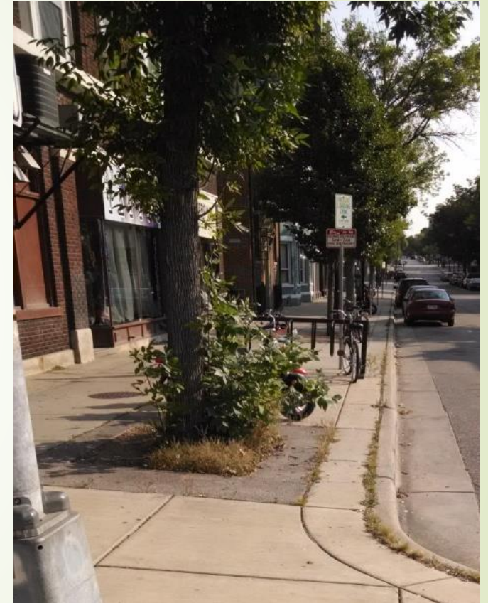
Gilman St Walks 2015