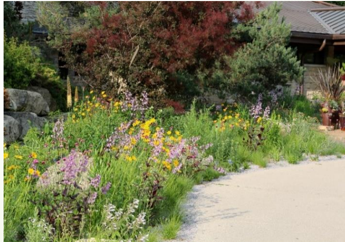
Gravel Gardens at entrance to Olbrich Botanical Gardens.

Concept has also been introduced at Goodman Pool and Mall Concourse