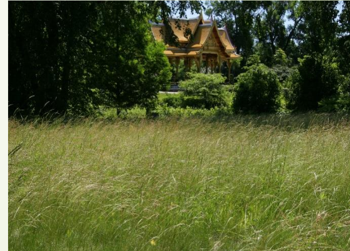
Serenity Garden meadow