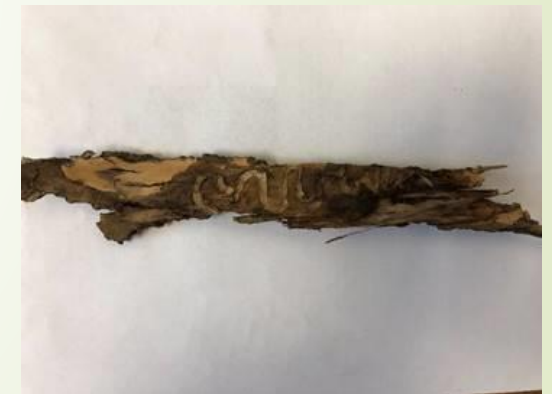
EAB galleries found during inspection of Ash tree.