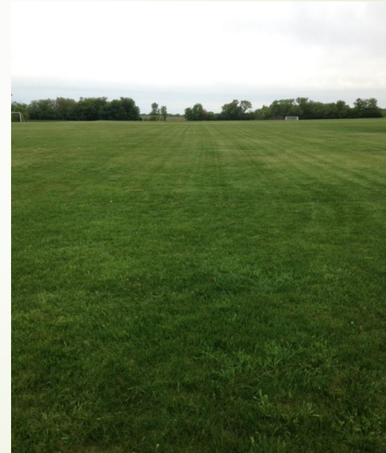
Riendahl Park -- 2015 following comprehensive renovation program.